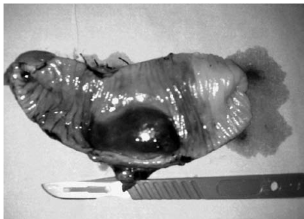
Fig. 3. Longitudinal section of the jejunal loop showing the intramural hematoma that caused bowel obstruction.