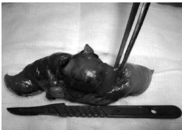
Fig. 2. Jejunal resection including the hematoma of 4.5x2.5 cm in size.

Intramural bowel hematoma was observed for the first time in 1838 by McLouchlan during autopsy of a man who died of bowel obstruction.