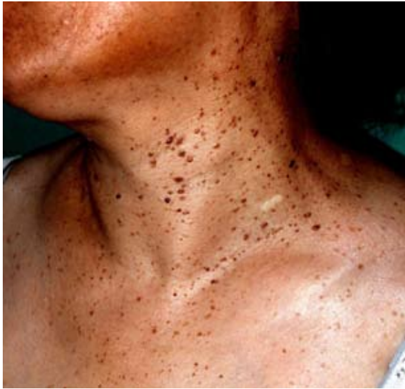
Figure 1. Multiple seborrheic keratoses on the neck scattering to the upper chest.

tests were all within the normal range. Chest x-ray and abdominal ultrasonography revealed no pathologic signs. Erythrocyte sedimentation rate was 30 mm/hour and tests for viral hepatitis, HIV and syphilis were negative. No abnormality was detected on abdominal, cranial and thorax tomography. Otolaryngological examination was normal. Esophagogastroduodenoscopy and colonoscopy were also normal. The patient was healthy and no change was observed on seborrheic keratoses during one-year follow up.