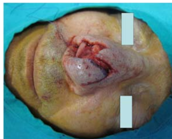
Figure 6. The thin layer of cartilage taken at the level of the quadrangular cartilage sept, sutured in its final site to guarantee a good structural support to the nasal ala.