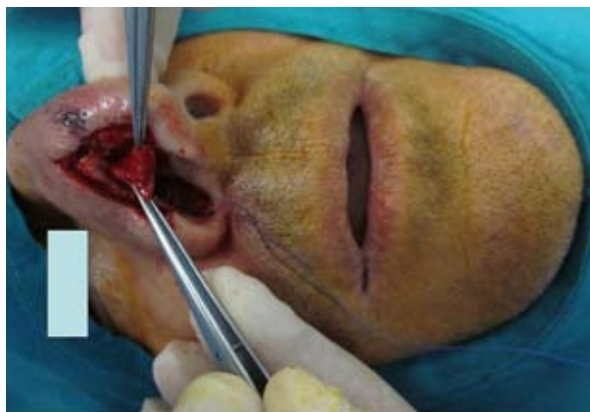
Figure 3. The right cavity nasal flooring was obtained with a small triangular flap with upper apex taken from the nasal sept mucous membrane and rotated onto the upper peduncle so as to keep the mucous membrane side towards the nasal cavity.

During surgery planning, we decided to include the substance loss in a triangle with upper apex and lower base and designed a second triangle with upper apex and lower base located at almost half way of the length of the side the first triangle, with BC almost the same as bC (Fig. 2). In the moving dynamics of our Mutaf triangular flap, A will be rotated in correspondence to a, B will be transferred onto b, and D moved onto d.