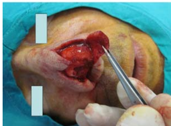
Figure 5. The second designed and autonomized triangle with the ample surrounding skin undermining, which allows mobilization of our flap.

Then we moved to the reconstruction of the right cavity nasal flooring with a small triangular flap with upper apex taken from the mucous membrane of the nasal sept and rotated on the upper peduncle in such a fashion as to keep the mucus side towards the nasal cavity (Fig. 3). The mucous flap was sutured into its final position by using reabsorbing sutures (Safil 4.0) and successfully reconstructing the inner side of the nasal cavity, the solution of continuity at the nasal sept level was partially sutured and partially left to self-heal (Fig. 4). Then we incised the second planned triangle borders and broadly undermined the nearby skin, guaranteeing the mobility of the skin to be transferred (Fig. 5).