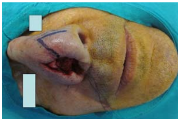
Figure 4. The mucous flap was sutured into its final site using reabsorbing sutures and successfully reconstructing the inner side of the nasal cavity. The solution of continuity at the nasal sept level was partially sutured and partially left to self-heal later on. The design of the Mutaf triangular flap still to be autonomized can be appreciated.

After local anesthesia with lidocaine 2% solution diluted and buffered with sodium bicarbonate, we started the procedure converting the defect to be reconstructed in a triangle with lower base as designed during the planning.