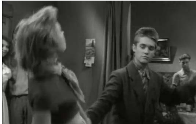
Figure 14: Tale of First Love

attempted to separate themselves from adults, early Soviet values and traditions still weighed heavily and limited the young generation's chances of separating themselves from their parents and educators.