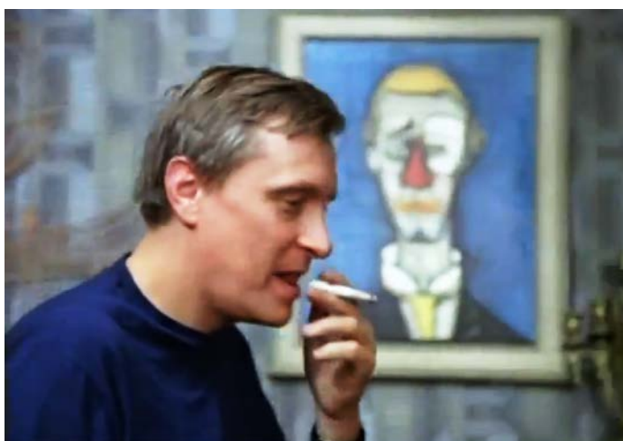
Figure 4: Autumn Marathon