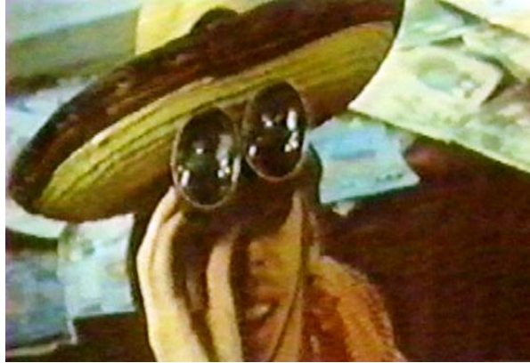
Figure 42: Passion and Anger

The teenage characters—Sergei and Len'ka—in both of Iasan's films are disillusioned as a result of experiencing ineffective interactions with adults and observing their parents' inability to understand and to help their children. They react differently to the injustices and disappointments of the current order, whether it is represented by the adults' actions or by the dysfunction of the parts of the system in general. They rebel, to some extent, through the attempts to take control over their lives and make their own decisions regarding suicide or through creating a special ironic, skeptical attitude toward the representatives of power. The moderately pessimistic realization that it was not possible to alter the situation was the first type of reaction to the changed conditions in the society under Brezhnev. These moods could explain the increased rate of suicides in the country. The second attitude was also common among Soviet people in the 1970s and early 1980s and has been described by Balina in her article, in which she writes: "We should not be surprised by the fact that, after a Soviet person had stopped 'respecting his kingdom,' he began not only laughing at his 'kingdom' (political anecdotes), but