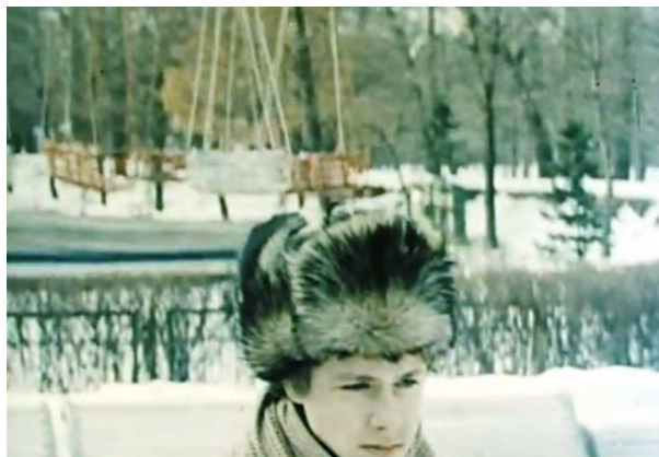
Figure 40: Please, Blame

The discovery of the discrepancy between what young Soviets learn both at school, from textbooks and socialist doctrines, and from their parents’ actions and lifestyles is revealed in the cinematic study of the teenagers’ reaction to their families’ “shallow” values in Please, Blame .