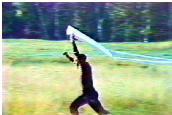
Figure 46: A Hundred Days

him, decide to accept the challenges of adult life—a life full of disappointments and betrayals. Their conversation takes place in the secluded space of the empty beach, without adult supervision. In the last scene of the film, a shot of a young boy running with a kite is juxtaposed with a shot of the kite flying and alternates with a shot of a group of teenagers standing in a field, with their heads raised, following the movement of the kite (See Figure 46). The kite is a metaphor of the freedom that the teenagers want to achieve. In The Lifeguard , Solov'ev uses a similar technique to the one in The Heiress Apparent to create a metaphor of maturation. After interrupting Asia's suicide attempt, Valia and she develop strong emotional connection with each other. In the closing scene, Valia rides a boat, which takes him and a group of other eighteen-year-olds to serve in the Army, while Asia says her farewells in the crowd left behind on the river bank. The boat is heading toward the horizon, and Valia's voice-over with the emotional music by Shvarts in the background explains to viewers that he has left everything behind, including his childhood and his old way of living.