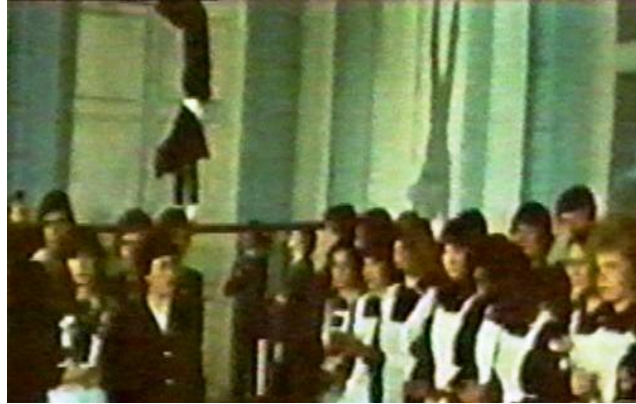
Figure 41: Passion and Anger