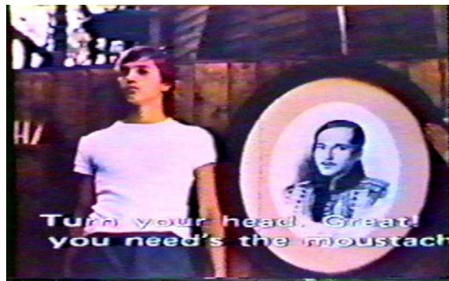
Figure 44: A Hundred Days