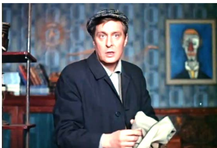
Figure 5: Autumn Marathon