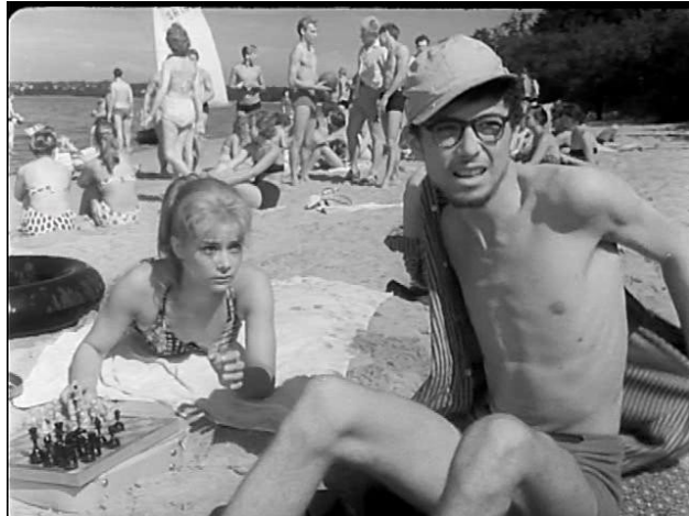
Figure 12: My Younger Brother

toward Western subcultures, shunning double-speak, and aspiring after independent judgment” (Terras 17). This young, independent generation is depicted as having a lot of free time and enjoying smoking, drinking alcohol, and spending nights at restaurants. This new portrayal of young Soviet citizens attracted the attention not only of the adult and young audiences and critics, but also of cultural producers. 60