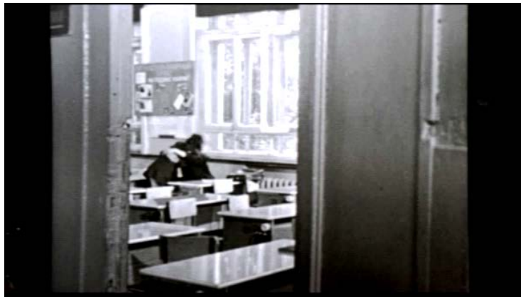
Figure 22: School Waltz