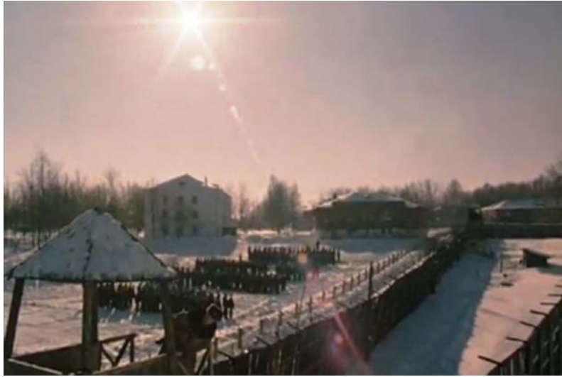
Figure 1: A Rail Station for Two

en-scène, the final eerie music contrasts greatly to the on-screen imagery, allegorically alluding to the fact that intellectuals like Platon Sergeevich are doomed to be sent to the outskirts of the Soviet Motherland so they cannot “harm” the rest of the society with their unconventional ideas.