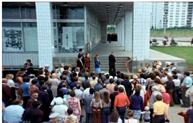
Figure 16: Not Even In Your Dreams

after this important consumerist event takes place (See Figures 16-17). The opening of a new consumerist heaven interrupts the everyday routine of high school students and their teacher, both narratively and visually. First, on-screen music from the opening interrupts classes, and the students run to the windows to see the source of noise. Then, in the next shot, a pair of scissors cuts a red ribbon, as part of the official opening ceremony. Metaphorically, this scene represents the “intrusion” of Western consumerism into the lives of Soviet people; however, for the young Brezhnev generation, it does not have a negative effect.