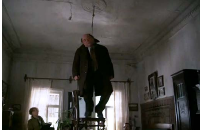
Figure 8: The Tears Were Dropping