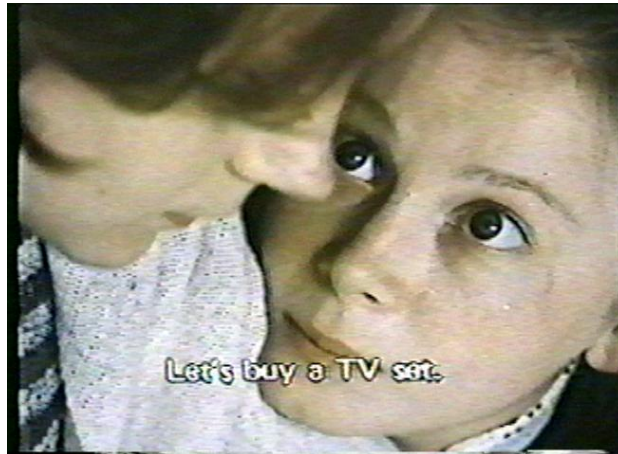
Figure 27: Other People's Letters

represented by fifteen-year-old Zina and her thirty-year-old teacher (545). 91 The acknowledgment and acceptance of new pragmatic, and to some extent even individualistic, values distanced the generation of vnye further away from other generations who still believed in socialist principles and in the capacity to achieve some measure of collective happiness.