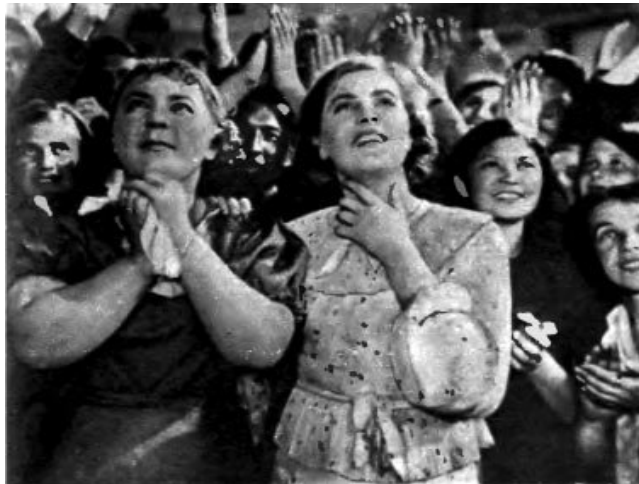
Figure 11: Komsomol'sk