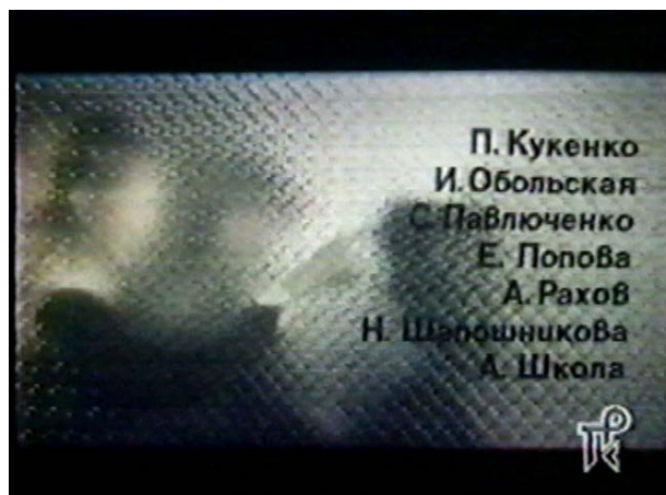
Figure 34: Keys