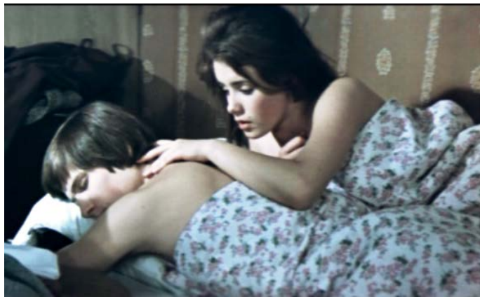
Figure 24: School Waltz

the boom of corruption among apparatchiki (representatives of the Soviet bureaucratic system) during the Brezhnev era, including corruption “in sexual terms,” more untraditional and less “restrained sexual interests” became apparent in popular culture. According to them, “while the representation of nudity and any kind of copulation, however ‘normal’ and heterosexual, remained taboo in literature and on film, there were often surprisingly overt depictions of erotic behavior” (342). Because, the state often ignored some instances of deviant behavior during the Brezhnev years, teenage sexuality also frequently was overlooked by Soviet authorities.