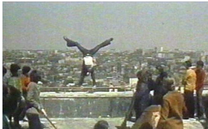
Figure 39: Please, Blame

However, this impulse toward individuation is not limited to provincial settings in the film. The city roof, for example, may serve as an urban equivalent. To impress Klava, Sergei stands on his hands upside down on the school roof (See Figure 39). The visually inverted position of the teenager on the screen works as a circumlocution that contributes to the construction of Aesopian meaning. At the literal level, this action can be understood as the teenager's attempt to show his uniqueness, to distinguish himself from other peers in front of his love object. At the metaphorical level, such behavior may indicate a desire to turn everything upside down: teachers' and parents' expectations, school rules, and behavioral requirements, which the system assigns to its young citizens. The image of the upside-down teenager is also an embodiment of the Brezhnev generation that craves for changes in the system.