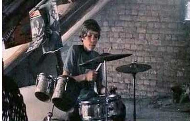
Figure 32: Woodpeckers

For the teenage protagonist in Woodpeckers , the drum beat also mimics the natural sound of a woodpecker pecking on the tree. Therefore, Asanova links two metaphorical objects—drums and a woodpecker—to Mukha’s craving for independence and self-realization. The woodpecker symbolizes the spirit of freedom for the teenage musician because it can make noise at any time, while adults limit Mukha in his choices. The title of the film— Woodpeckers Don’t Get Headaches —functions as an allusion to the woodpeckers’ ability to heal the diseased body of trees as their main task, without having concerns for anything else. Woodpeckers are a metaphorical representation of the late-Soviet generation that is also interested in “curing” Soviet society from empty ideological postulates and ineffective state policies. This ability to fix, change society may be considered dangerous by the state, and that is why Stakan Stakanych, as a representative of state bureaucrats, presumably, kills Mukha’s woodpecker in the second half of the film. By this action, he encroaches on the teenager’s freedom of expression through drumming and adherence to foreign music. However, Asanova makes sure that the young generation wins the battle with the stale state power, and in one of the final scenes, the sound of the woodpecker interrupts the aural structure of the shot. This pecking signifies the