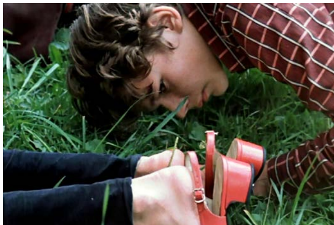
Figure 19: Not Even In Your Dreams

Roma and Katia hold each other in an empty apartment with a subsequent scene in Roma's kitchen when his happy face and playful mood confirm the teenagers' sex in the preceding scene (See Figure 20). 75 Galina Shcherbakova's novel, on which Frez's film script is based, was subjected to a less severe censorship than its film adaptation, and more openly discussed the teenage protagonists' attitudes and thoughts regarding sex. Because Frez had to receive an approval from the studio administration, any explicit depictions of sex among teenagers could not make it to the final version of the script.