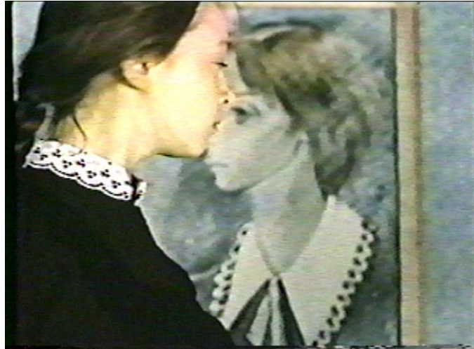
Figure 28: Other People's Letters

Figure 28). This scene signifies a shift from worshipping literary and cultural figures under Khrushchev to the prevalence of personal icons: contemporaries who are not much different from the rest of the society.