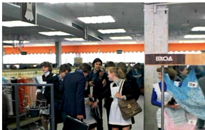
Figure 17: Not Even In Your Dreams