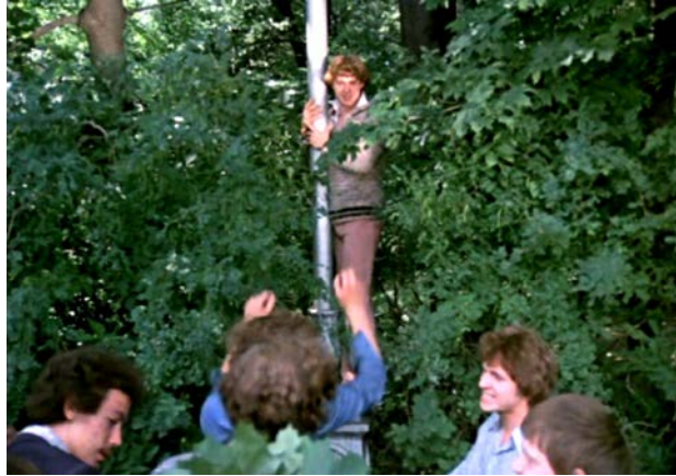
Figure 21: Not Even In Your Dreams

During the Brezhnev period, the growing importance of individualism and the partial rejection of the collective as a supporting structure led to the development of separate unofficial youth communities that protected young people from adults' harmful intervention. In Frez's film, when Tat'iana Nikolaevna fails to defend her students from their unsympathetic parents and teachers, a group of Roma and Katia's classmates supports the teenage lovers. Unlike the classmates in Thaw films about teenagers' first romantic relationships, the high school students in Not Even in Your Dreams form a small supportive community that excludes parents and teachers. This secluded, closed community becomes one of the main characteristics of many films of the 1970s and alludes to various communities of intellectuals during the Brezhnev era, represented by samizdat groups, the unofficial journal Metropol' , and underground artists.