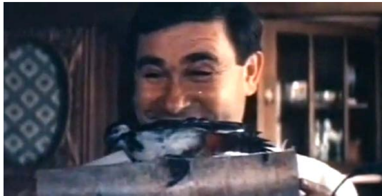
Figure 33: Woodpeckers

translation from Russian would mean “The Glass, Son-of-the-Glass”), Asanova describes her misfit Mukha in a positive light (See Figure 33).