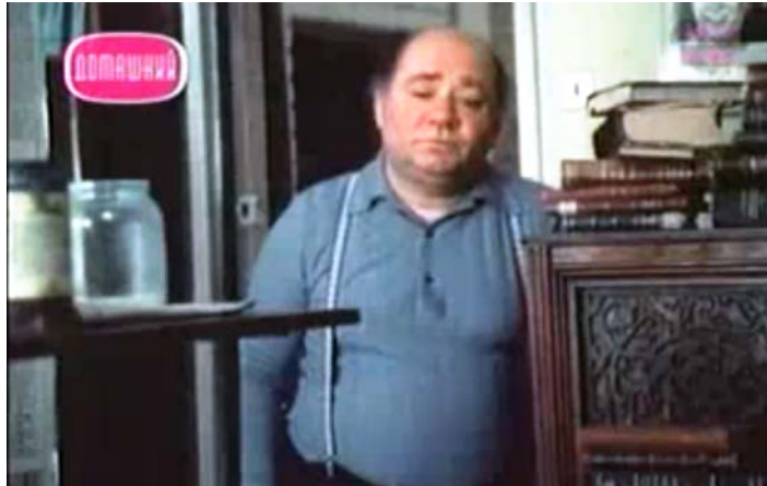
Figure 7: Autumn Marathon

Another popular Aesopian device that Loseff discusses in his book is a shift, defined by him as “marking exotic, historical, and fantastic parables” that can operate at different levels (111). Aesopian screens are created through geographical and temporal shifts. The events of the film may take place in another country, far away from the place of concealed criticism. The time frame may also be displaced, or shifted. Screens work more effectively if both the original place and time are distanced from the imaginary time and place of the cinematic narrative. At the same time, it is typical of Soviet filmmakers to revisit the historical past of the country, which is the target of Aesopian criticism, thus relying only on temporal shifts and avoiding geographical shifts. During the Brezhnev years, films that revisited Russia’s past and that could be subjected to an Aesopian analysis include Nikita Mikhalkov’s At Home Among Strangers , A Stranger Among His Own ( Svoi sredi chuchikh, chuzhoi sredi svoikh , 1974) and A Slave of Love ( Raba liubvi , 1975), Sergei Solov'ev’s The Stationmaster ( Stantsionnyi smotritel' , 1972), Il'ia Averbakh’s A Love Confession ( Ob'iasnenie v liubvi , 1975), and Petr Todorovskii’s The Last Victim ( Posledniia zhertva , 1975). Some of the films of that time period touched upon sensitive