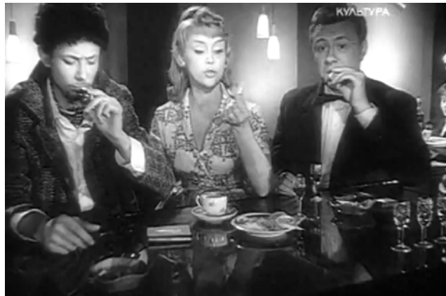
Figure 13: My Younger Brother