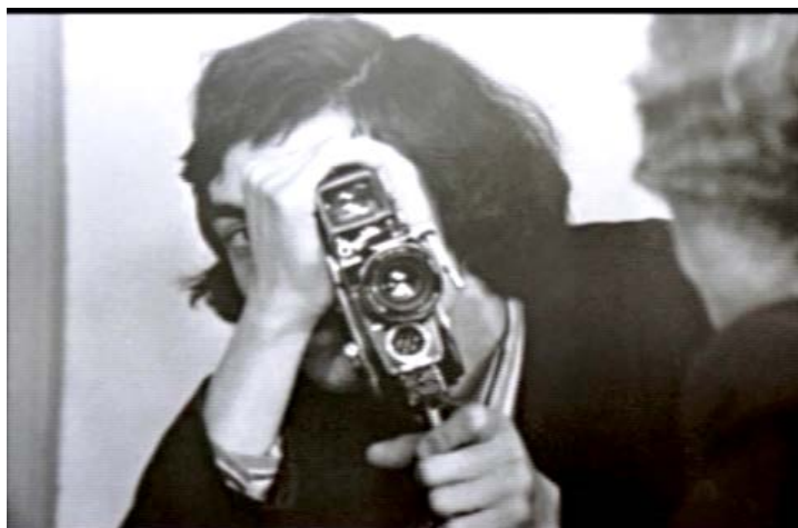
Figure 23: School Waltz