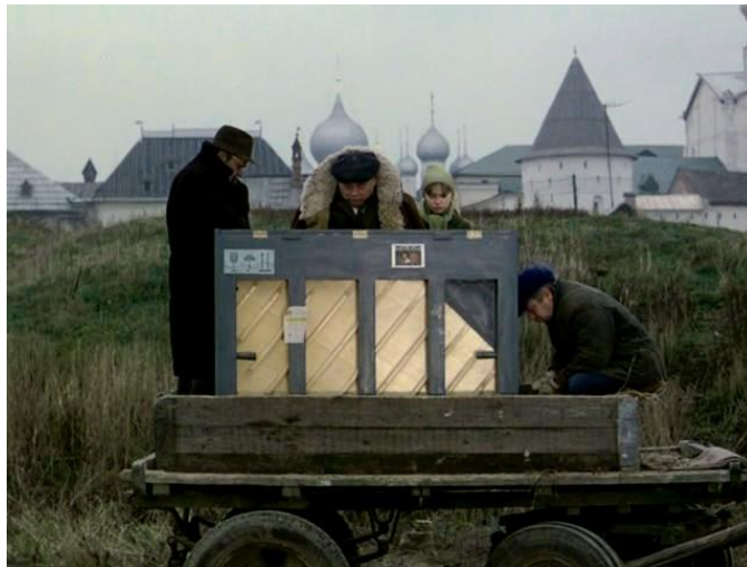
Figure 9: The Tears Were Dropping

Viktor Tregubovich's If You Are Going, Go ( Ukhodia ukhodi , 1978) also operates with absurd elements that are already introduced in the opening scene depicting the crowded funeral of a bureaucrat. The dead man, with his semi-bald head and gray hair, visually resembles Nikita Khrushchev, the First Secretary of the Communist Party prior to Brezhnev. The camera's close focus on the dead man's ridiculous white shoes may be understood as a reference to the so-called