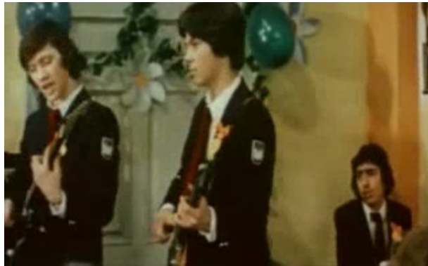
Figure 37: The Practical Joke

official school band, are the young musicians depicted playing music in the daylight in the classroom (See Figure 37). This is also the first time when the band is depicted playing for an audience, consisting of their classmates and some teachers. Therefore, Igor's band loses its unofficial, underground status and becomes a part of the system, both narratively and visually.