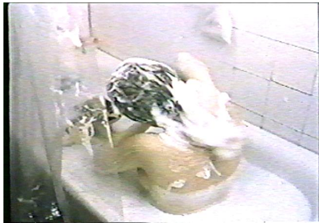
Figure 29: Other People's Letters

Zina naked in the bathtub, while Vera Ivanovna rubs the teenager's back with a sponge (See Figure 29). The camera focuses on Vera Ivanovna's hands, and Zina humbly touches her teacher's wet hand and kisses it with passion and adoration. Thus, in Other People's Letters , Averbakh makes plain that the relations between a high-school student and a teacher has the capacity to cross clear ethical borders in the context of the Soviet school under Brezhnev's regime. The teenager's active sexuality, along with her craving for material well-being, ground her more deeply in an emerging pragmatist, material culture and create a profound gap between her and Vera Ivanovna, whose relationship with her boyfriend are depicted as more platonic, or even poetic.