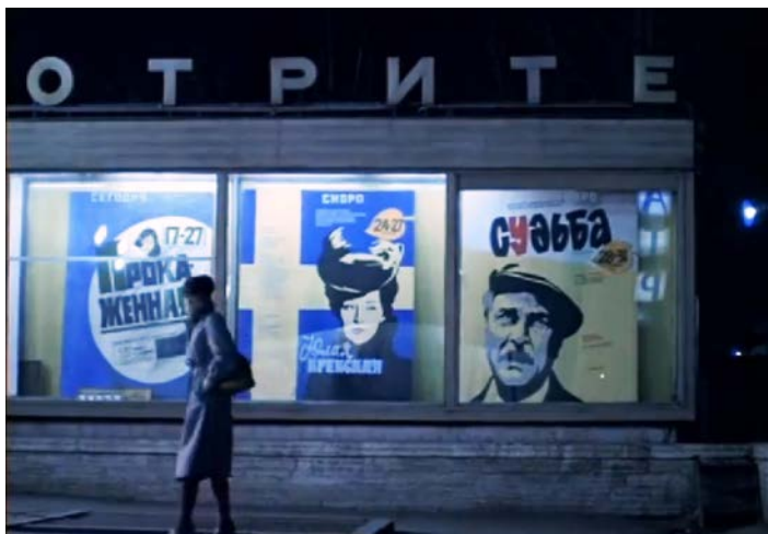
Figure 3: Autumn Marathon