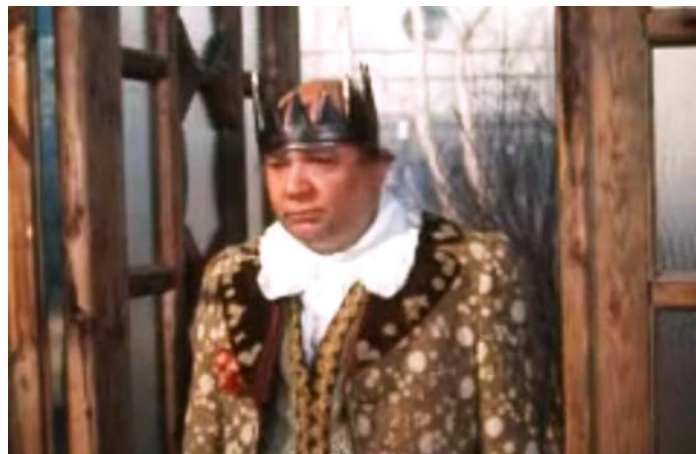
Figure 6: An Ordinary Miracle

( Otpusk v sentiabre , 1979), or Kharitonov in Autumn Marathon (See Figures 6-7). The ability to reframe a character into an object of parody is important for Aesopian practices because it creates an opportunity to criticize or mock authoritative figures and administrators without openly revealing these feelings. Other examples of indirect mocking of people in power in Brezhnev-era Soviet cinema include the role of the minister in An Ordinary Miracle and the member of court nobility in Nadezhda Kosheverova's The Shadow ( Ten' , 1971), both played by Mironov, who became highly popular with Soviet audiences thanks to his roles as the Count in Leonid Gaidai's The Diamond Arm ( Brilliantovaia ruka , 1968), Fardinar in Leonid Kvinikhidze's The Straw Hat ( Solomennaia shliapka , 1974), and Ostap Bender in Mark Zakharov's The Twelve Chairs ( Dvenadtsat' stol'ev , 1977). It is difficult for viewers to ignore Mironov's previous acting as a trickster and imposter while looking at his serious, "authoritative" roles. Therefore, through the deliberate casting choices, cinema opens an additional field for Aesopian practitioners to ridicule indirectly the cinematic characters who serve as referents or analogues for Brezhnev-regime bureaucrats.