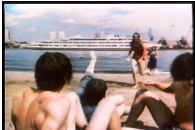
Figure 30: Confused Emotions

on the beach without adult supervision. Even the light, cheerful music in the beach scene, reminiscent of the music in a series of films about the American teenage girl Gidget, creates a feeling of lightheartedness and happiness. In Arsenov's film, the white tourist boat on the river, which is set as a background for the youth collective, symbolizes leisure and entertainment, unlike the industrial cargo ships and military boats in preceding Soviet cinematic traditions, which usually represented civic duty, technological progress, and patriotism. By indirectly referring to the genre of American beach movies, Arsenov's film partially disengages from the Soviet context and places the story about Soviet teenagers in a Western framework.