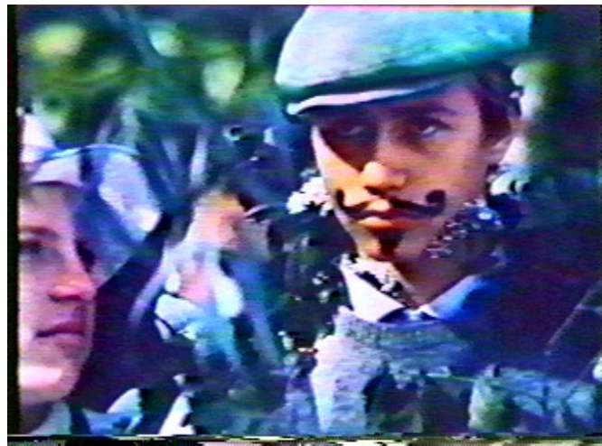
Figure 43: A Hundred Days

usually end up developing their own unique identities, based on the cultural traditions they have absorbed earlier.