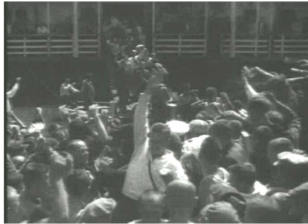
Figure 10: Komsomol'sk

as a result of unrequited love. 56 Gerasimov emphasizes the importance of the collective visually: both in the work place and the domestic space, the young Komsomol members are usually depicted together with their colleagues (See Figures 10-11). This characteristic of a young collective is one among a few that travels to the Thaw cinema and youth films under Brezhnev.