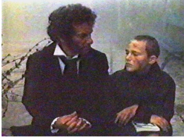
Figure 45: The Heiress Apparent

For Zhenia, Pushkin is a source of inspiration and creativity and, as Sandler puts it, “the muse to a young girl seeking to create her own destiny” (193). Zhenia’s freedom includes her choice to continue believing in Pushkin’s creative power. According to Sandler, The Heiress Apparent “proves that Pushkin retains the capacity to create that zone of safety, one which can provide safe passage toward maturity for even the quirkiest young woman” (193). Even after Zhenia’s childish dreams are partially shattered by her love object, Volodia, she still remains loyal to the ideals of the nineteenth century poet. According to Romanenko, “a while ago [Zhenia’s] predecessors in the films A Hundred Days After Childhood and The Lifeguard were discovering this world for themselves, were experiencing this discovery as ‘a sunstroke,’ were learning to preserve and save it, as a sacred island, were learning to pay for their loyalty to [this world]” (27). 187 Romanenko argues that, unlike other teenage protagonists in Solov’ev’s trilogy, Zhenia sacrifices her illusions and tries to “protect [this world], even in the most ridiculous,