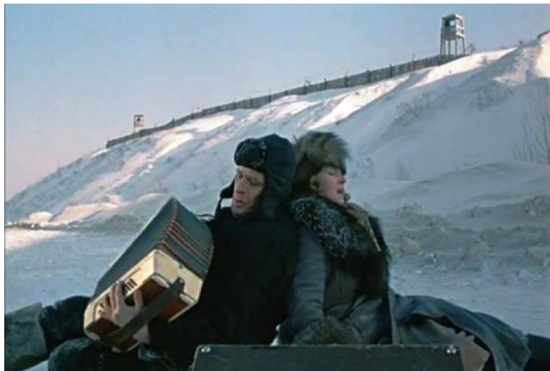
Figure 2: A Rail Station for Two