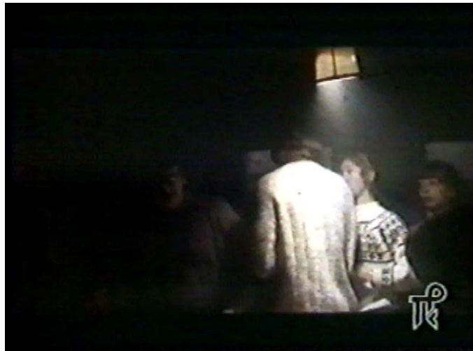
Figure 35: Keys

from adults, are allegorical representations of intellectuals who develop various ways of circumventing state representatives.