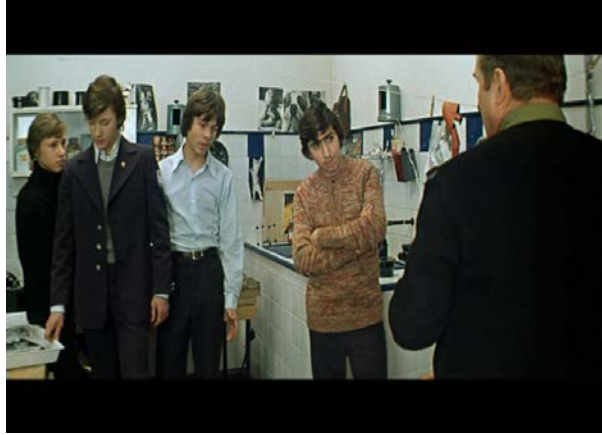
Figure 36: The Practical Joke