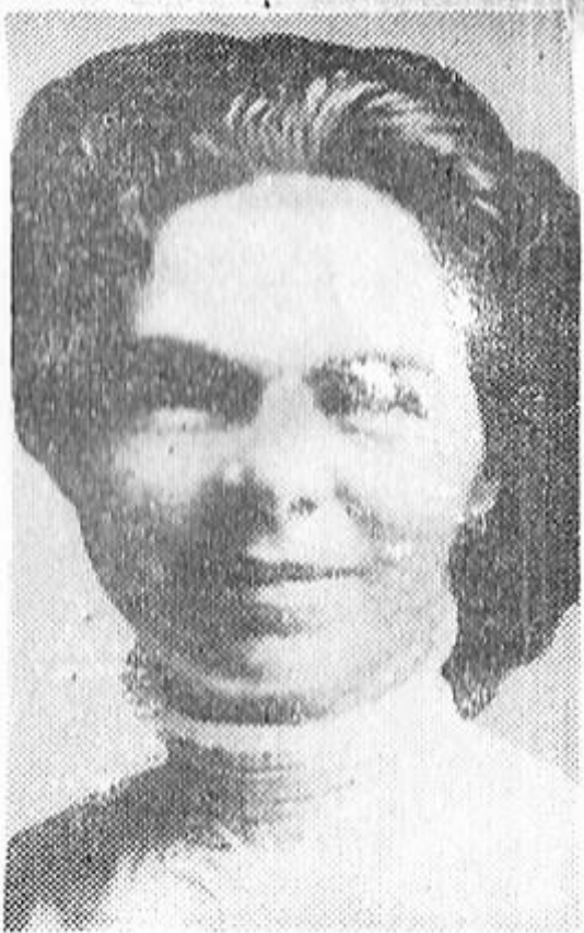
Cara Reese, only woman to cover the Johnstown Flood, was founder of Women's Press Club