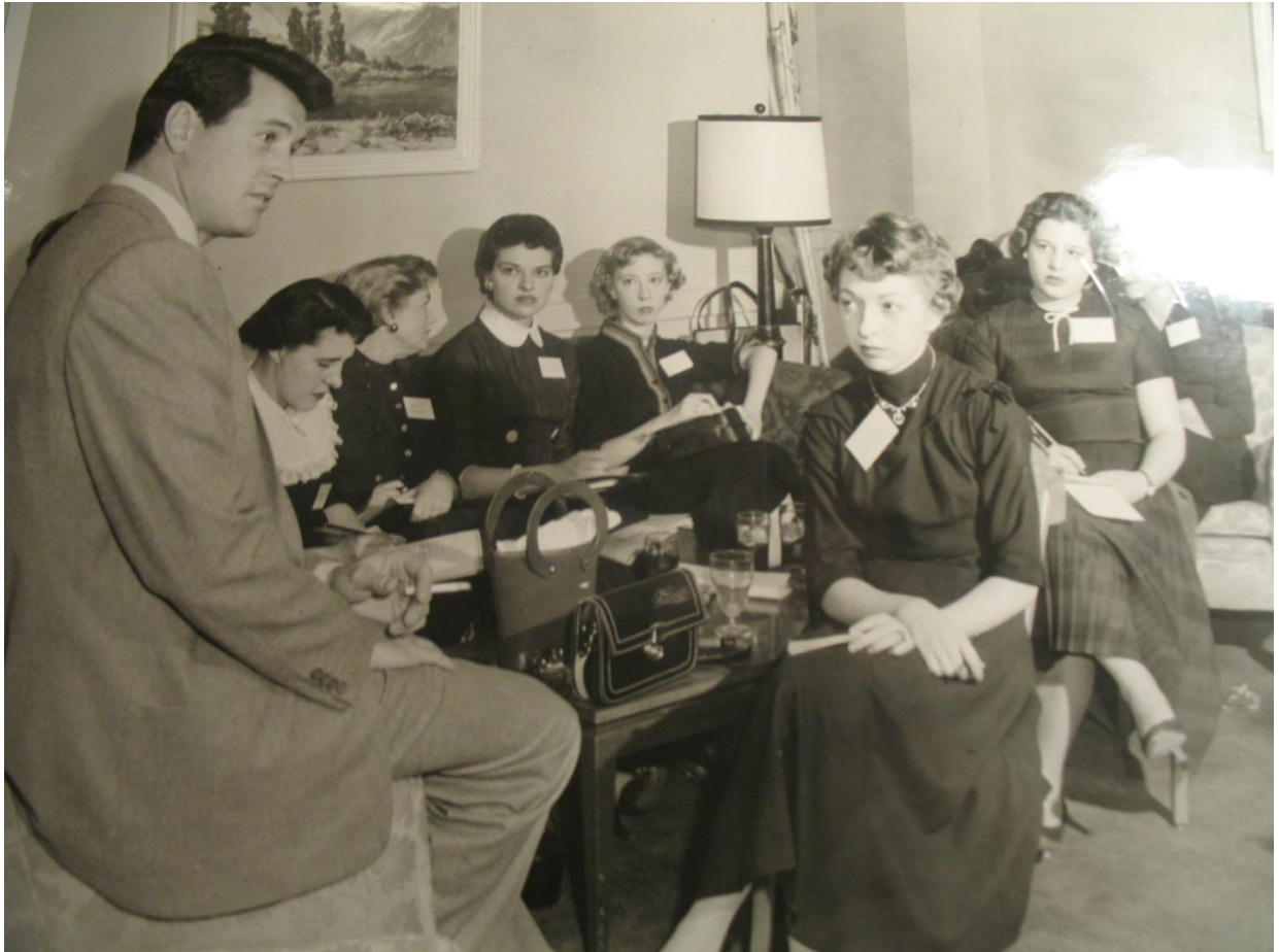
Figure 3.6: Rock Hudson being interviewed by Gertrude Gordon Scholarship hopefuls, circa 1957.