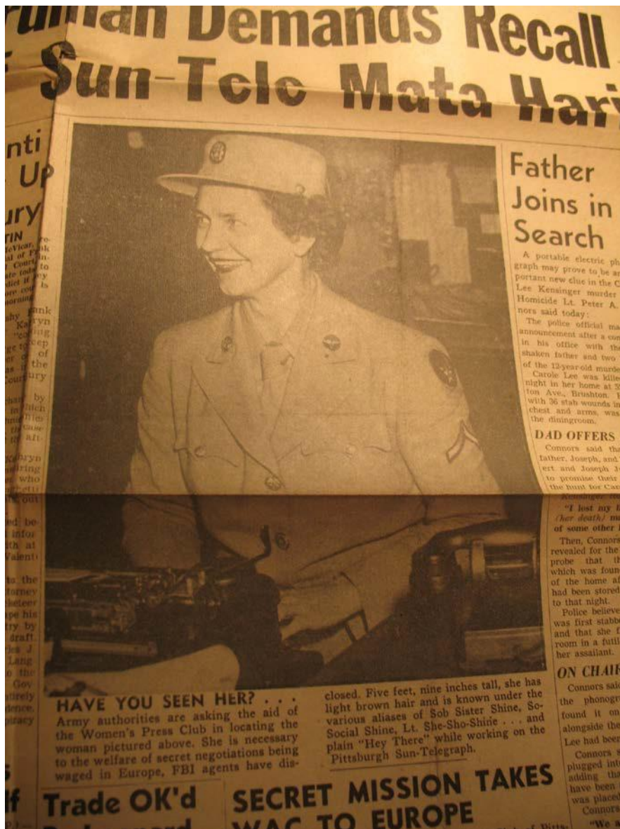
Figure 3.3: December 15, 1948 cover the Pittsburgh Sun Telegraph requesting the return of Lt. Bernice Shine to active duty in the WACs. The headline says, "U.S. Urgent Need of Lt. Shine: Truman demands recall of Sun-Tele Mata Hari."