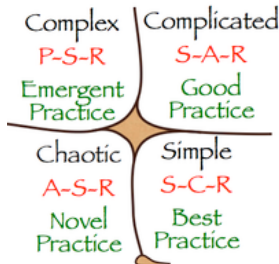
Figure 1. The Cynefin Framework (Snowdon & Boone, 2007).

Each domain of the Cynefin framework represents different levels of expected achieved practice. In the simple domain, we can expect “Best Practice”. In the complicated domain, we can expect “Good Practice”. In the complex domain, we can expect “Emergent Practice”, and in the chaotic domain, we can expect “Novel Practice”.