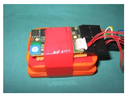
Figure 2 – A wireless MTx+CB

(i.e. the one between the OASIS and the remote repository) to use non-overlapping channels. A common alternative way is to packetise the samples, i.e. buffer multiple samples, prior to transmission in order to reduce overhead. The results of our second experiment show that the packet loss is least when a packet size of ~1,200 bytes was used. The feasibility of this solution, however, would depend on whether a suitable hardware candidate for in-network processing can be identified (i.e. one that is small and lightweight enough). Our other experiment results show that, the packet loss rate is different for sensors placed on different parts of the body (8% for foot, 2% for knee, >1% for arm). The reason for this is likely to be the height dependency of reception – changing Fresnel zones and ground reflection effects [5]. Figure 2 shows our first sensor prototype: the MTx sensor connects to a connectBlue (CB) WiFi module through a RS232 interface.