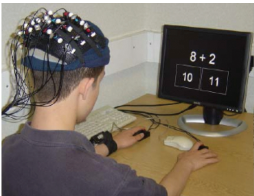
Figure 2 fNIRS. Shows young participant wearing a cap with source and detector optodes. fNIRS has several advantages over fMRI: it is more comfortable; it provides good temporal resolution (sampling at 10 Hz); it has been widely used with children from neonates onward; and it is even portable. On the other hand, the spatial resolution is much lower than fMRI (but better than EEG), and, currently, block-design experiments work much better than event-related.

Brain systems for mathematics. How the brain systems for mathematics (especially the intraparietal sulci) develop from infancy to adults is not known, either in normal or atypical development. One reason is that it is difficult to use fMRI with children (they move too much, or they fall asleep, in the scanner). EEG does not, at the moment, give sufficient spatial resolution to map the developmental trajectory, but it may be that functional Near InfraRed Spectroscopy (fNIRS) could be the answer, since it currently resolves at about 0.5 \text{ cm}^2 , with better resolution likely in the near future. Current systems are portable, and comfortable for young participants (see Figure 2). fNIRS measures regional cerebral blood flow, like fMRI, but unlike fMRI, at present it can only measure this in cortex and not in deeper structures. This is sufficient to see arithmetical processing (Iuculano et al., 2008) and there is now software for carrying out appropriate statistical analyses on the optical signals (Peck et al., submitted).