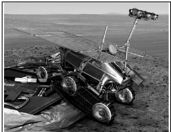
Fig. 1. Artists impression of the ExoMars rover