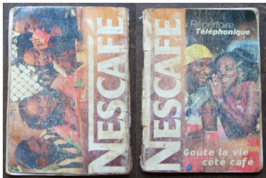
Figure 1: L's Nescafé telephone booklet, back and front cover

Materially, L lives a poor and simple life. He occupies a room and parlour in his uncle's house which he shares with me when I am around. L has decorated his room with empty packs of the cigarettes he smokes, a poster of hiphop artists like 50 Cents, and pages from a UK magazine on the wall showing the marriage of Welsh rugby star, a reportage of celebrities with their mums, the Beckhams before David's transfer to Real Madrid, sexy film stars in tiny swimsuits, and more glitter and glamour. He further possesses two or three pieces of furniture, a box with clothes and a two deck radio cassette player powered by a car battery.