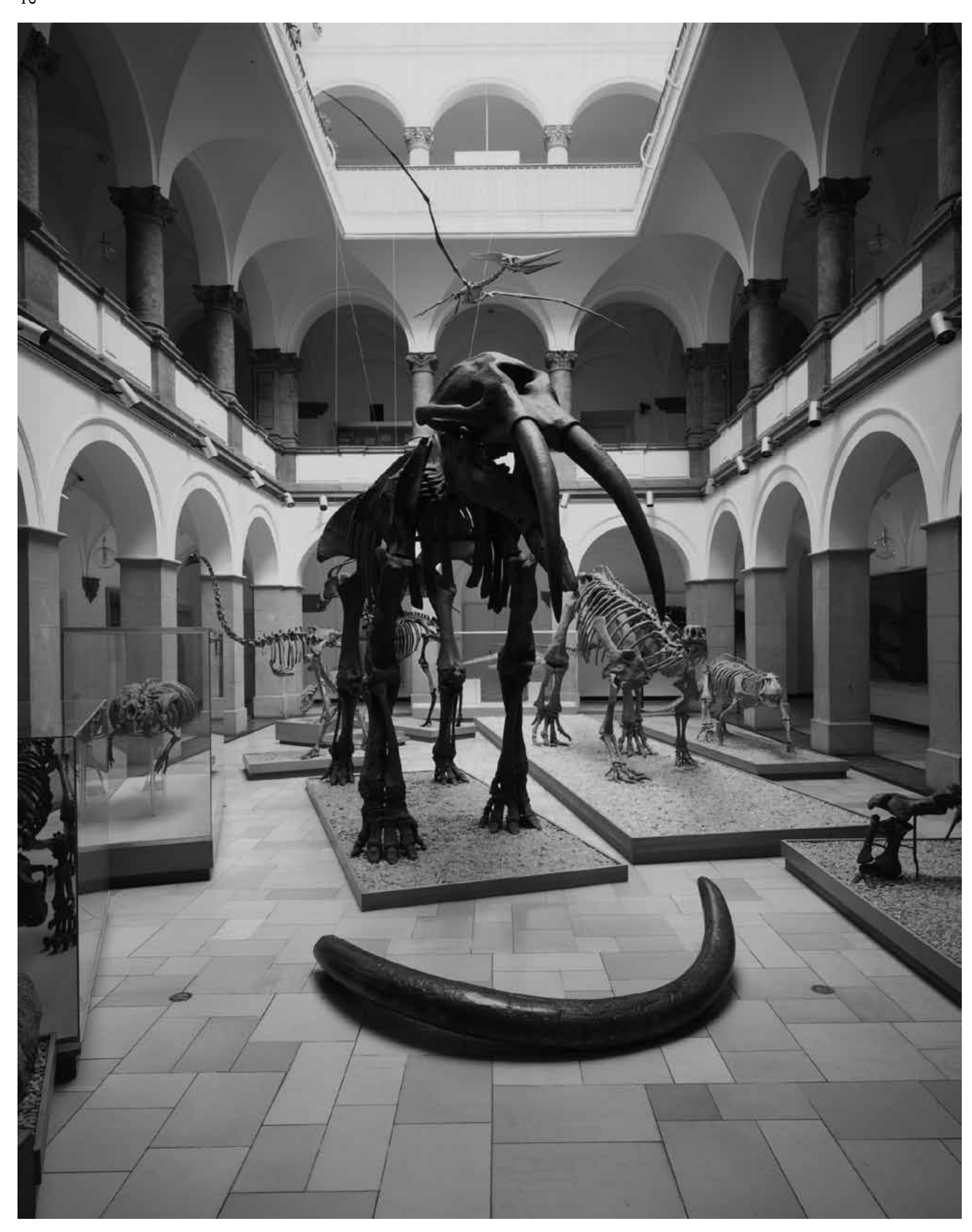
Atrium of the Paläontologisches Museum München with Gomphotherium aff. steinheimense as centerpiece