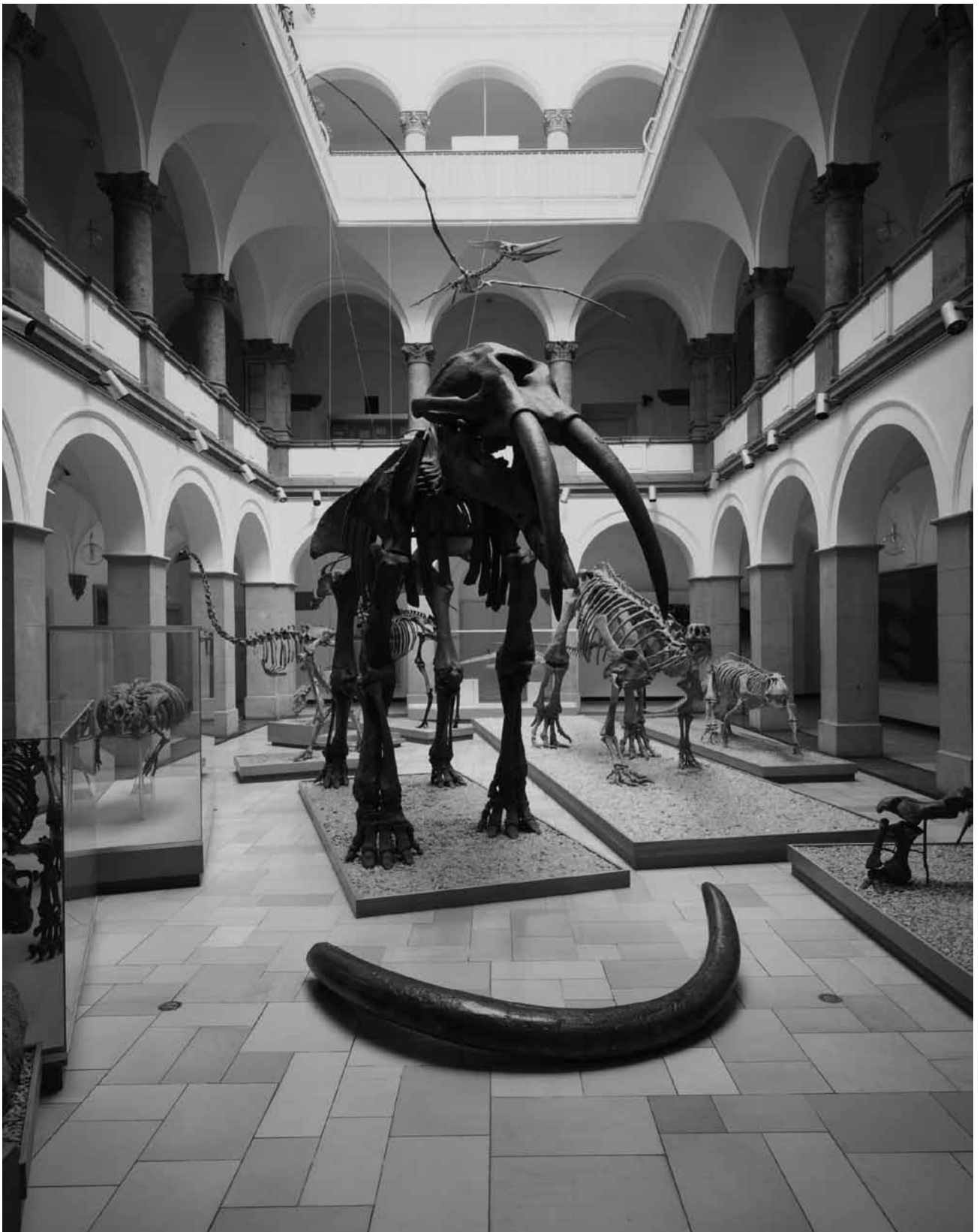
Atrium of the Paläontologisches Museum München with Gomphotherium aff. steinheimense as centerpiece