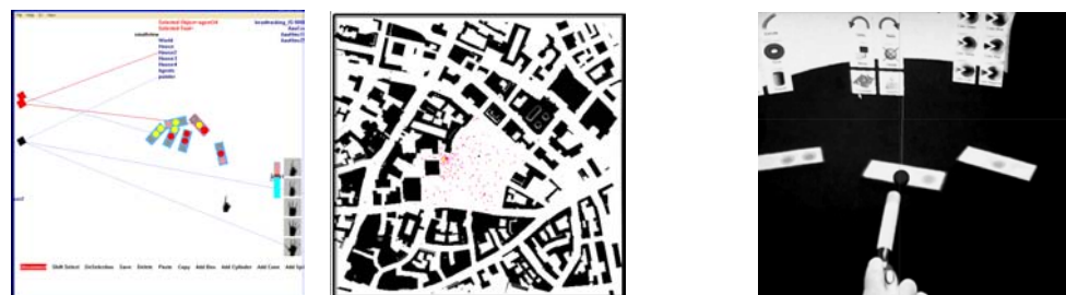
Figure 3 Linking the agent software in GRAIL (left). Interaction with CAD menus in ARTHUR (right)

5. The ARTHUR system has integrated a major CAD system (MicroStation) enabling architects and engineers to directly create and manipulate a virtual (CAD) model during design and review sessions. The virtual model is displayed on top of the Augmented Round Table using the head mounted displays. By using a 3D pointer or finger gestures, the users are able to draw directly in the (augmented) real world, without having to use a separate CAD workstation. Virtual menus floating above the Augmented Round Table allow CAD tools to be selected, e.g. drawing b-spline curves, spheres and tori, as well as extruding surfaces and changing colors. After selecting a tool users are able to draw the appropriate objects in 3D space. Additionally, the users are able to move and delete objects. The virtual menus are bound to placeholder objects (Figure 3 right) and therefore can be moved around on the table to get them into the view or move them out of the view to enlarge the working space. The system architecture will allow all tools and functionality of the CAD software to be integrated into the ARTHUR system, e.g. solid modelling, constraint solving, etc. As such, 'full fidelity' CAD models are created and interactively displayed by the system; there are no translation or conversion issues and the CAD models can be used directly in downstream design processes (Broll et al, 2004).