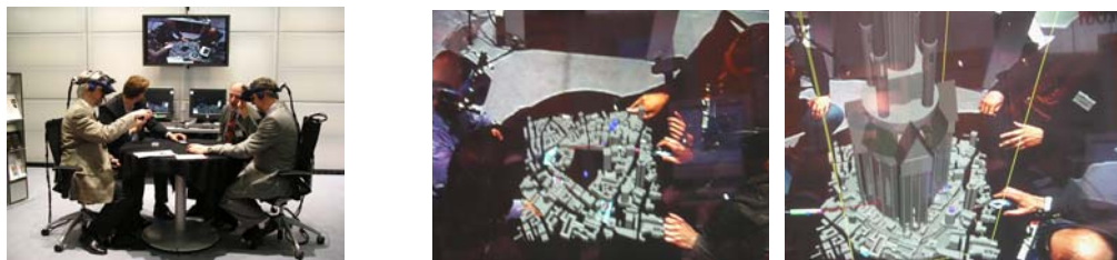
Figure 4 Multi user interactions and play with the church scale - CeBit 2004

All in all, the CeBIT test runs were highly successful. They provided not only valuable feedback on shortcomings, more importantly they verified the approach and the direction taken in developing ARTHUR. Most users quickly got into using the system and were then happy and willing to play with it and - on several occasions – test its limits (many users managed to scale the example church to several times its original size and seemed to enjoy the resulting dwarfing of the cityscape) (Figure 4).