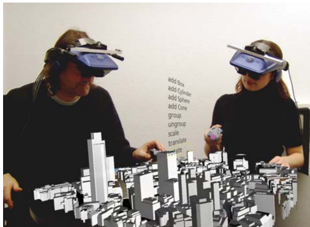
Figure 1 Collaboration within the ARTHUR environment

We present our approach ARTHUR, which integrates form creation with the simulation of functional performance, such as the simulation of pedestrian movement, as an important component of the collaborative design table. ARTHUR uses optical augmentation and wireless computer-vision (CV) based trackers to support collaboration within the 3D environment (Figure 1). Computer Vision techniques take input from stereo Head-Mounted Cameras (HMCs) and a fixed camera, to track the movements of placeholders on the table and the user's hand gestures. Virtual objects are displayed using stereoscopic visualization to seamlessly integrate them into the physical environment. Moreover, and unlike most AR systems, complex geometry can be directly created within ARTHUR using the integrated CAD system (MicroStation), which supports more advanced functionality such as 3D sketching and complex solid modelling.