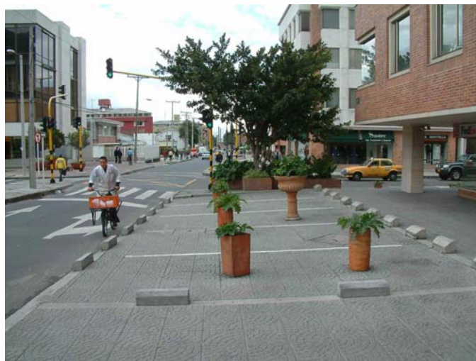
Figure 8. Bogotá has converted much of its previous parking space to public space.

The city has also dramatically reformed its control on parking. On-street parking has been eliminated from most streets, with privately contracted firms providing off-street parking services. In many cases, the previous parking bays have been converted into more attractive public space (Figure 8).