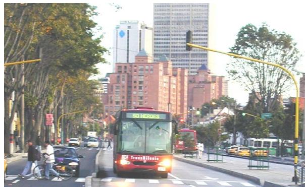
...this, in just three years.

The Bogotá BRT system, known as TransMilenio, included an initial phase with 40 kilometres of dedicated busways that was delivered at a cost of US$ 5.3 million per kilometre, considerably less than rail-based options. Most BRT systems today are being delivered in the range of US$ 500,000 to US$ 10 million per kilometre. By contrast, elevated rail systems and underground metro systems can cost from US$ 50 million per kilometre to over US$ 200 million per kilometre. The lower cost allowed Bogotá to finance the initial phase largely through existing local resources and not through international loans. A portion of the national petrol tax in Colombia is dedicated to financing local transit.