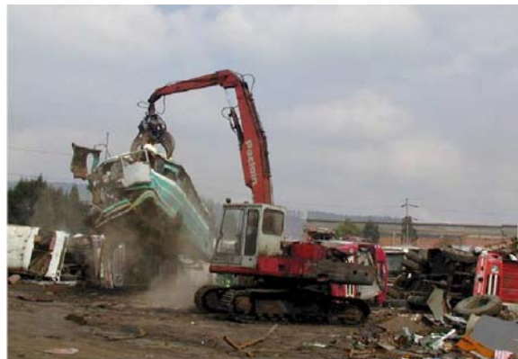
Figure 9. In phase 2 of TransMilenio, for every new articulated vehicle introduced into the system, 7.0 to 8.9 older vehicles are destroyed.

Like much of Latin America and elsewhere in the developing world, Bogotá's public transport sector has historically not been highly regulated. The result has been a large proliferation of small private sector operators who compete aggressively with one another for a relatively captive transit market. Such market conditions can create relative inefficiencies in which an oversupply of small vehicles translates into congestion and high levels of contamination. Prior to TransMilenio, over 22,000 public transport vehicles of various shapes and sizes plied the streets of Bogotá. In order to rationalise the system, companies bidding to participate in TransMilenio were required to scrap older transit vehicles. During the first phase of TransMilenio, the winning bids agreed to scrap approximately four older vehicles for each articulated vehicle introduced (Figure 9). In the second phase, the successful bids committed to scrapping between 7.0 and 8.9 older buses for each new articulated vehicle. The destruction of older vehicles prevents the "leakage" of these vehicles to other cities.