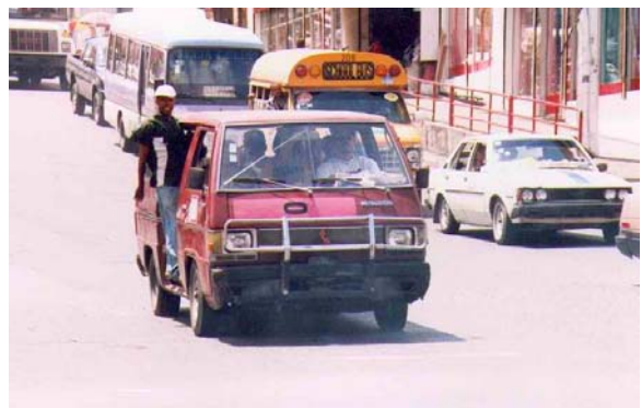
Figures 1 and 2. The poor quality of public transport in developing cities creates great hardship for the citizenry.

However, all of these problems can be rectified within the modest budgets of developing-nation municipalities. Cities such as Bogotá (Colombia), Curitiba (Brazil), and Quito (Ecuador) have dramatically improved transit services with simple solutions. In each case, the city relied upon low-cost improvements in public transit and non-motorised infrastructure rather than expensive tailpipe technologies.