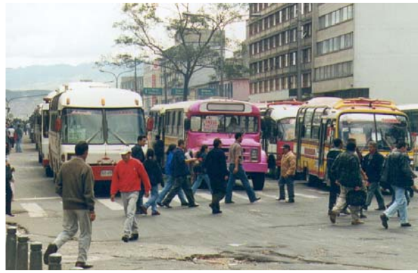
Figures 5 and 6. Bogotá went from this to...