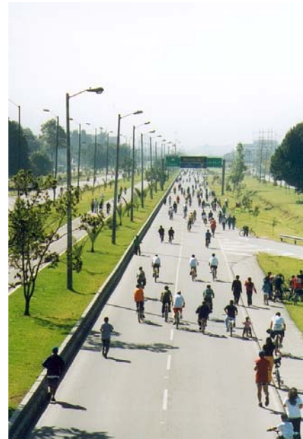
Figure 7. As many as two million of the city's inhabitants take to the streets during Bogotá's weekly car-free Sundays.

Bogotá has also gained fame for its development of car-free events. Each Sunday 120 kilometres of arterial roadways are closed to private motorised vehicles (Figure 7). In their place, as many as two million inhabitants take to the streets as cyclists, skaters, and strolling families. The festive atmosphere of the Sunday "ciclovía" (bicycle street) is credited with creating a great sense of community and citizen culture in the city. Bogotá is also holds the world's largest car-free weekday event, covering the entire expanse of the city's 28,153 hectares. The first car-free day during a weekday was held in February 2000. The day has become institutionalised through a public referendum. On 29 October 2000, 63 per cent of the voters in Bogotá approved a referendum to make the February car-free day event permanent. Additionally, Bogotá is also home to what is called the world's longest pedestrian corridor, "Alameda Porvenir". This 17-kilometre stretch of pedestrian and bicycle paths connects several lower-income communities to shops, employment, and public services.