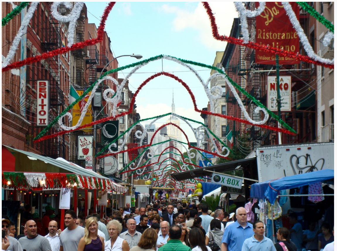
Little Italy, New York City: Photo by davidpc_

The introduction to the book provides a good mapping of the potential of a visual approach in understanding change. Given that visual sociology is a relatively marginalised stream within traditional sociology, Krase provides us with a comprehensive argument of the importance of the visual in urban studies. This is in line