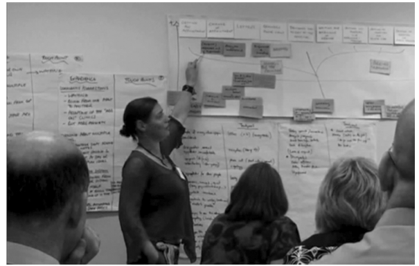
Fig. 3. A participant using the emotional map to describe a patient story.

The persistence of the emotion map supported the design activities in a number of ways. Both lay participants and health professionals used it while presenting their stories, each person pointing to different parts of the map as shown in Fig. 3. When groups began to prioritise issues, the participants could remind themselves and each other of the important themes. One health professional said in response to a public participant raising an issue, "oh yes, there were lots of them [post-it notes] for that, weren't there." When the language of discussion turned to clinical themes, the facilitators used the map to re-focus the