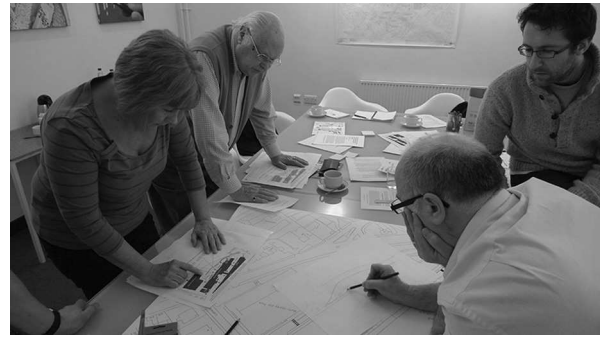
Fig. 2. People working around "A Road" map.

The emotional maps provided a temporal collation of the patients' and health professionals' experiences and concerns that could be shared with the alternate group. In the session in which public participants and health professionals first came together, representatives from each group used the map to explain their perspectives, tell stories and summarise their concerns for discussion.