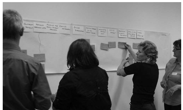
Fig. 4. Participants putting post-it notes on the emotional map.

Once design activities move beyond understanding the current situation to exploring future design proposals, they will inevitably require a wider, and perhaps less familiar, vocabulary. Well chosen representational artefacts can 'scaffold' participation, in the sense of providing supports