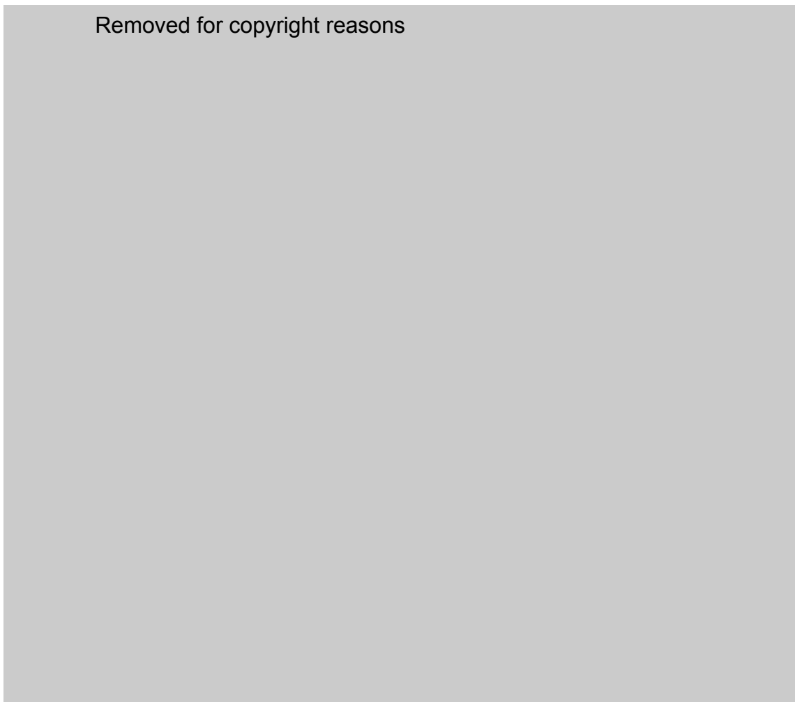
Figure 6.3: Overview population development

documents, provides new insights into how the city is imagined to develop and which thoughts accompany these expectations. At first sight, it appears as if population loss was the main measure for identifying problem areas. The main criterion of spatial categorisation, ‘stability’, seems to characterise the tendency of an area to lose population. Figure 6.3 maps ‘stability’ on Hoyerswerda.