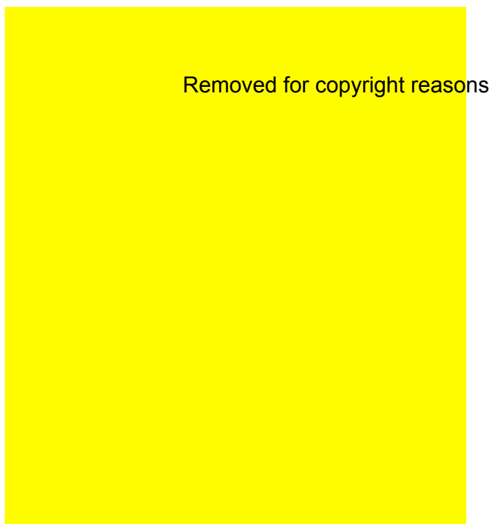
Figure 5.2: Schwarze Pumpe

After WWII Germany was divided into the Soviet Occupied Zone (SOZ) and the Zone of the Western Allies: Hoyerswerda was situated in the Eastern-most part of the SOZ. In 1949, the SOZ became the socialist state of the GDR with a centrally planned economy. Hoyerswerda, at that time, was part of the government district of Cottbus. In the early years of the GDR, the decision was made that the coal mining area close to Hoyerswerda should develop into the Energy Centre for the whole country. At the heart of this development was the industrial district 'Schwarze Pumpe', approximately 15 km north-east of Hoyerswerda (see Figure 5.2), where coal-processing plants were to be located and which were to be fed by the surrounding open cast coalmines.