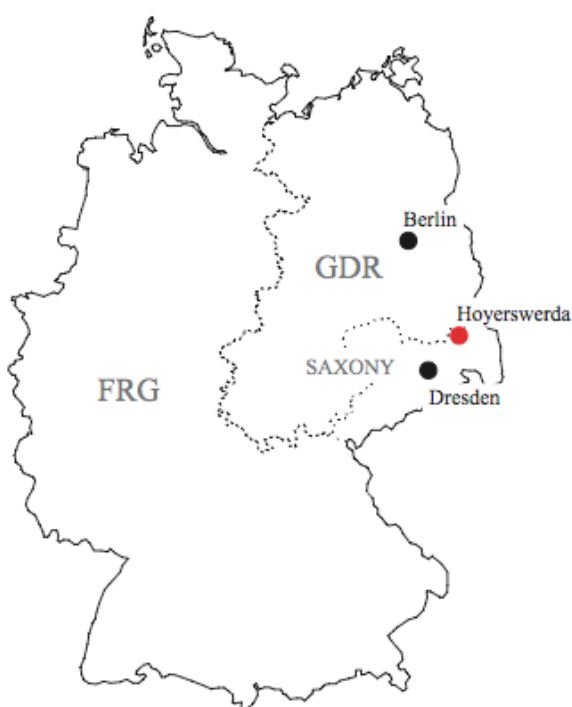
Figure 5.1: The location of Hoyerswerda

This chapter provides context and background material for the shrinking city of Hoyerswerda, which was chosen as an exemplar for the empirical analysis of this thesis. Hoyerswerda is located 160 km south east of Berlin and about 60 km east of Dresden (see Figure 5.1). It is part of the Land Freestate of Saxony [ Freistaat Sachsen ] and of the County Bautzen [ Kreis Bautzen ].