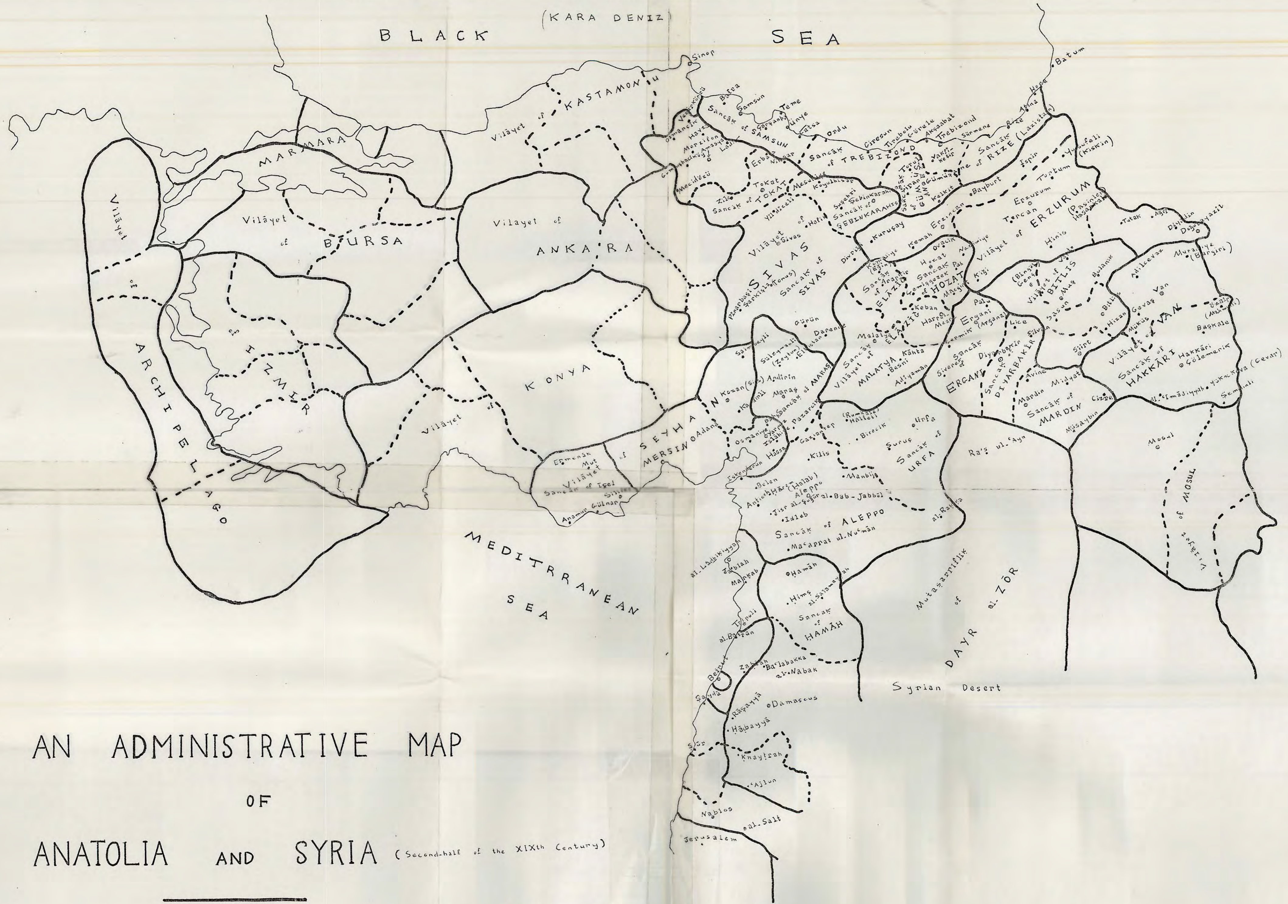
AN ADMINISTRATIVE MAP OF ANATOLIA AND SYRIA (Second-half of the XIXth Century)