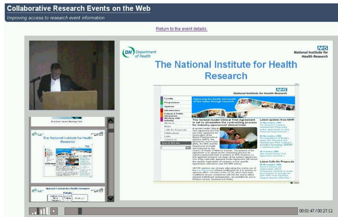
Figure 1. Example of a prototype (pilot release 1) of the CREW replay application

overview on the left and the actual slide in the main view – is configurable in the editing process and can be presented differently in the progress of the event. The slide overview then might show thumbnails of questions and answers to jump to, with the main window showing the speaker or the audience. The control elements in the bottom bar provide functionality to control the recording (loudness, play/pause, position bar, elapsed time, total time).