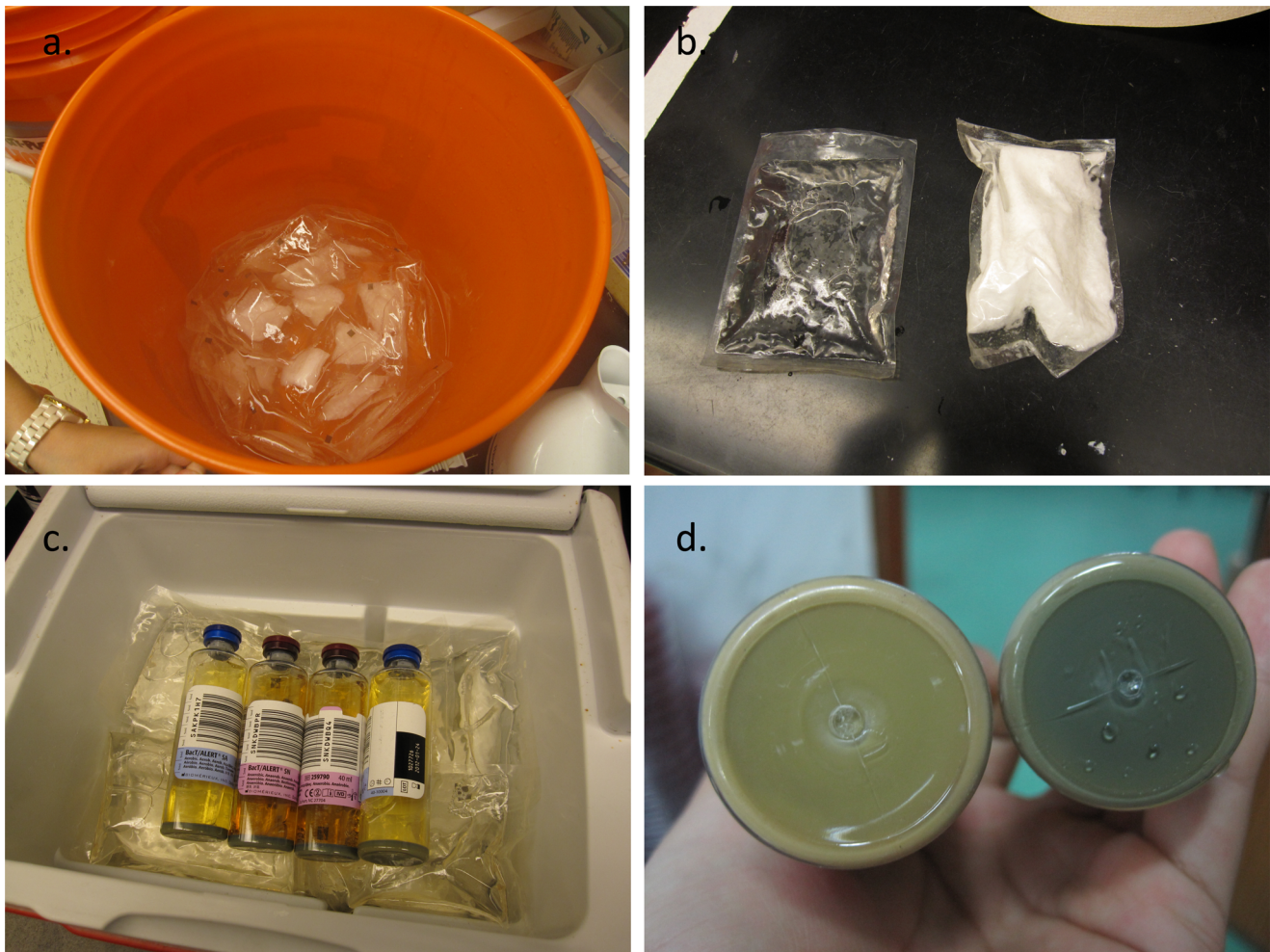
Figure 2. Electricity-free typhoid diagnostic approach. a. packets containing a phase-change material are heated in water or direct sunlight. b. after heating the phase change packet (right), the material appears as a clear liquid (left). c. phase change packets and bottles, containing blood from typhoid suspects and vancomycin additive, are placed into an insulated container. d. bottles are inspected every 24 hours for color change of a CO 2 detector, which distinguishes positive (left) from negative (right) cultures. doi:10.1371/journal.pntd.0002292.g002

Other pathogens were identified in blood from 5 of 304 (1.6%) of patients by the conventional blood culture system; we did not identify an alternative pathogen using the experimental blood culture. The alternative pathogens included Streptococcus pneumoniae (1 patient), other Streptococci (2 patients), Staphylococcus aureus (1 patient) and Acinetobacter spp (1 patient). Twenty-three patients (7.6%) had blood cultures positive for organisms believed to be commensal or skin contaminants; these were seen in 21 (6.9% of total patients) of the conventional blood cultures and 2 (0.7%) of the experimental blood cultures. The majority of commensal organisms (16 of 23; 69.6%) were coagulase-negative Staphylococci .