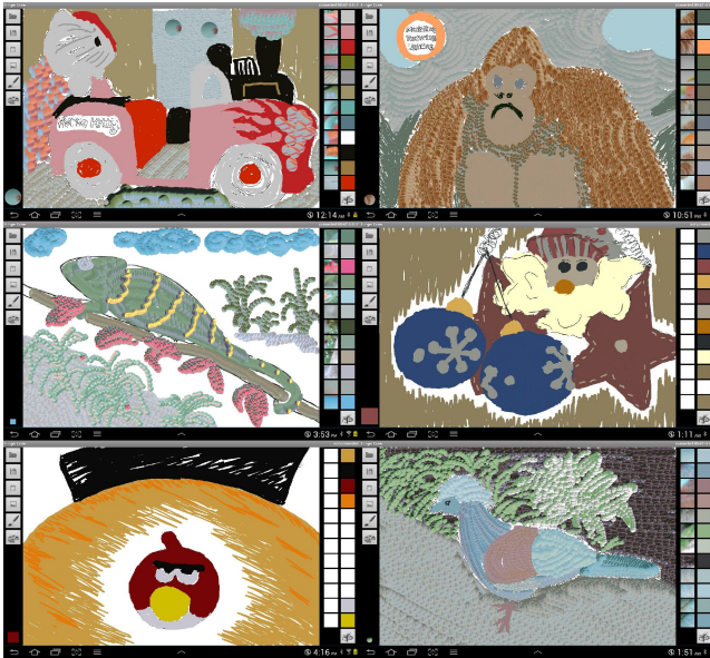
Figure 7: Some of the drawings made using FingerDraw.

being simultaneously in touch with nature and engaging in digital arts. It invites children to actively explore and study their environment as an inspiration for objects, scenes, colors and textures, which can then be used in their digital drawings. Because of its portability, children may explore the setting outside the house or playroom, and make drawings on the spot wherever they find exciting sceneries, colors and textures. Alternatively, they can save a palette of scenes, colors and textures inside the finger-worn device for later use in their drawings. A smaller form-factor and intuitive pairing with the drawing canvas would help in encouraging children to see FingerDraw as an extension of their finger. Despite the current limitations, we believe FingerDraw system would help children to be more engaged and aware of their surroundings.