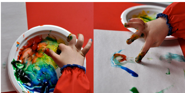
Figure 2: Traditional finger-painting: the child touches the real paint and applies it to the canvas. Paint adheres to the fingertips.

FingerDraw is inspired by the way in which early artists obtained colors from nature. It extracts colors, textures, as well as traces of entire scenes and objects from everyday life, and converts them into digital ink. Through finger augmentation, it allows children to use the same finger for both capturing these environmental attributes as well as drawing with them. As a result, children are encouraged to think of digital ink adhering to their finger just as is the case with using real paint for finger-painting (Figure 2) 3 . By building upon this familiar activity, we intend to draw the attention of children back to interacting with the real physical world.