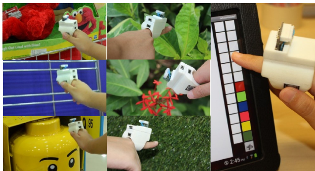
Figure 6: Storing a palette of colors inside the finger-worn device

FingerDraw stores a color palette inside the finger: On the way back home, she encounters some colorful leaves and bark on various trees in the park, which she stores as a palette of favorite colors and textures inside her finger-worn device. Once at home,