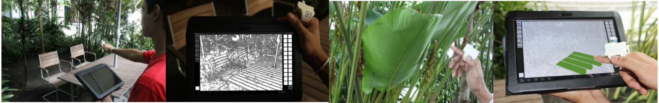
Figure 1: Children can capture sketches of real scenes, and pick colors/textures from objects in their surroundings

2 MIT Media Lab, 75 Amherst Street, Cambridge, MA, 02142