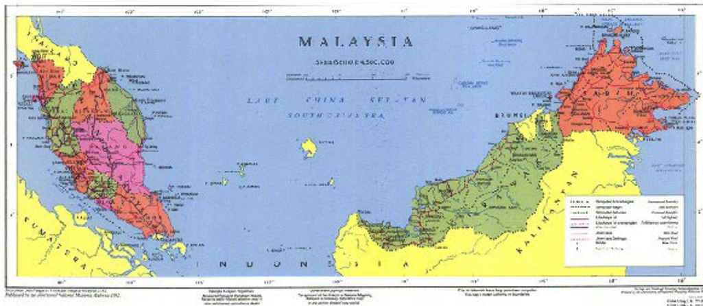
(Figure 1.1: Map of Malaysia)

through its Ministry of tourism has launch “ Malaysia is truly Asia ” program that attract tourists world-wide (Ministry of Tourism Malaysia).