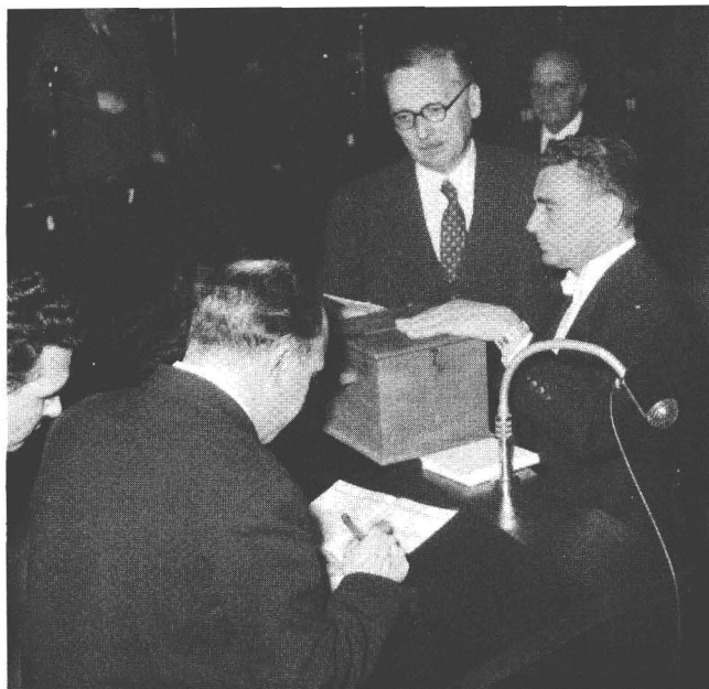
Rene Plevin, leader of the Liberal Group in the European Parliament, casts his vote for a permanent capital. Brussels won the membership's top recommendation.

Luxembourg—gave Brussels a clear lead, with 170 points, followed by Strasbourg with 161, and Milan with 155. The first stage of the vote eliminated Paris, Oise, Stresa, Turin, and Monza; the second produced the following result: