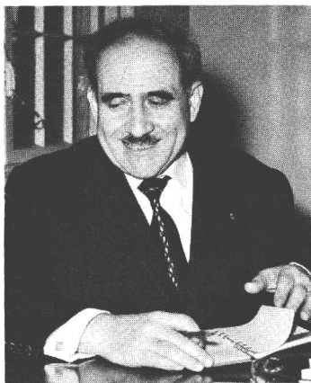
Louis Armand, President of EURATOM: "... Euratom must . . . serve as a catalyst to speed the modernization of our countries."

In another modification, the Joint Committee deleted the word "proven" which had been used to describe the reactor types to be built by the utilities of the Euratom