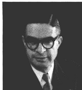
Jean Rey, the Belgian member of the European Economic Commission, stresses importance of a European Economic Association with the Common Market without tampering with the treaty.

It was clear, M. Rey continued, that it would be impossible to solve all outstanding problems by January 1, 1959, the date when the first tariff cuts occur in the Community. Even if it were possible, ratification in the various national parliaments would be unlikely to take less than a year. The Commission therefore repeated its proposal for a provisional arrangement by which tariffs would be generally reduced by 10 per cent throughout the European Economic Association countries on January 1 to coincide with the tariff reductions of the Six. This would give a period of two years from now until the next round of tariff reductions in the