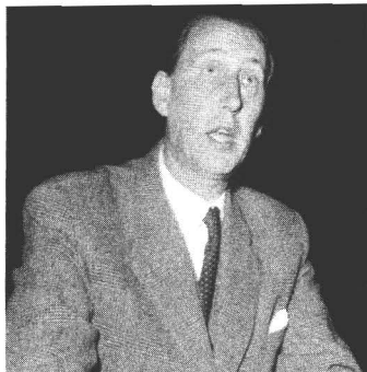
High Authority Vice President Dirk Spierenburg hammers his point for fair competition between the Community and European Economic Association countries.

Common Market. By that time an agreement on a European Economic Association could be signed and ratified. If the negotiations fell through, each country would have complete freedom.