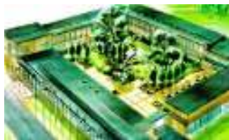
The FVO offices, Grange, Co. Meath