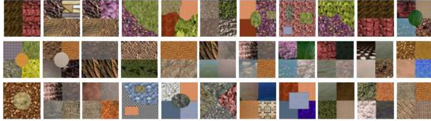
Figure 2: The database of 33 mosaic images used in our experiments.

The quantitative measurements were carried out using the Probabilistic Rand Index (PR) (Unnikrishnan and Hebert, 2005) that measures the agreement between the segmented result and the ground truth data and takes values in the range [0, 1] . A higher PR value indicates a better match between the segmented result and the ground truth data. The PR Index is defined in the appendix of this paper. In this study, for every analysed texture analysis technique, the PR mean and standard deviation were computed for all images in the database.