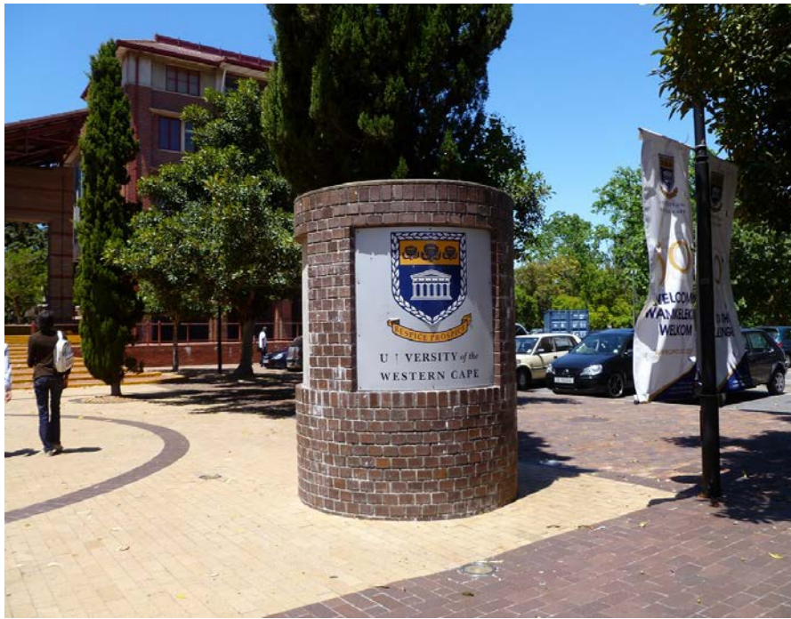
Figure 1. The entrance to the University of the Western Cape (2010).