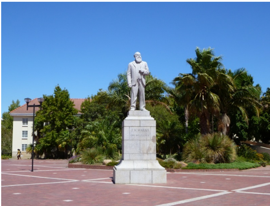
Figure 2. The Red Square of the University of Stellenbosch (2011).