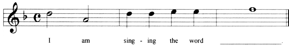
Fig. 1. A sample sung stimulus. The melody is a fragment from Haydn's “Lob der Faulheit” (“In Praise of Idleness”) in which the original text, “Faulheit, endlich muss ich dir” has been replaced with our carrier phrase. The blank line indicates where the target word was sung. This carrier phrase was used to eliminate contextual effects on the intelligibility of the target words.

Stimuli were recorded in an 800-seat auditorium/recital hall. Vocalists were positioned approximately 4 meters from the front edge of the raised stage, near the center. Recordings were made with permanently installed stereo overhead microphones placed approximately 10 meters from the vocalist. Both the position of the vocalists and the microphone placement conform to normal performance practice for this auditorium. No effort was made to measure the reverberation time for the hall. However, the recordings made in these circumstances were judged by the authors to be similar in reverberation and ambience to standard recital recordings. Notice that the stereo microphones were closer to the singer than would be the case for 95% of the audience members for a hall of this size.