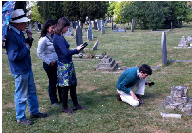
Fig. 2. Using mobile devices to look up database records and to photograph the graves

The photos that were taken by people outside could be uploaded in real time to appear on an interactive bird's eye view map of the cemetery displayed on the tabletop (see Figure 4). When indoors, participants were able to see photos being added onto the tabletop view of the graves – initially appearing in the form of coloured dots. Touching a dot resulted in bringing up the image taken there, and any information connected by the participants. The smartphones also allowed for texting and phone calls to be made between those inside and those outside in order to exchange information and generally plan the activity between group members. Live video images from a camera outside were shown on a wall display indoors, providing those indoors with a live roaming feed for allowing them to see what those outdoors were doing.