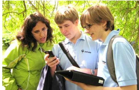
Fig. 5. School children showing their photos and describing their discoveries to a researcher in the cemetery

information on families, regiments and war locations. Throughout the afternoon groups around to enable all to switch between being indoors and outdoors. The volunteers in the cemetery started by photographing graves and then used the iPads to look up records in an attempt to link them together. They also interacted with the map on the tabletop indoors and guided the others outdoors on missing information.