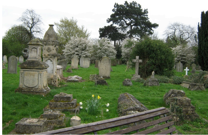
Fig. 1. Headstones in the cemetery

The cemetery (see Figure 1) is situated in a small city in the UK. There are around 20,000 burials in the cemetery, most in unmarked graves, with around 3,500 marked by headstones. Some of the headstones are very old, overgrown, and covered in lichen. The people buried there were from a variety of backgrounds and part of the pleasure of visiting the cemetery is to imagine and discover more about them.