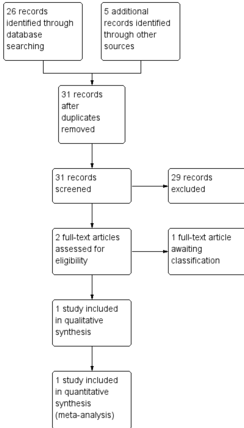
Figure 1. PRISMA study flow diagram (for the current version of the review).