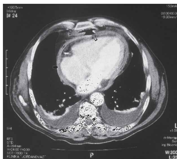
Fig. 3. MSCT scan of the thorax showing contrast in the pericardium (white arrow) and gastric tube (blank arrow). Note: bilateral pleural effusions.