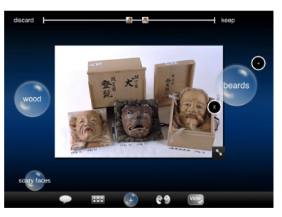
(b) The forum scene for in-depth discussion