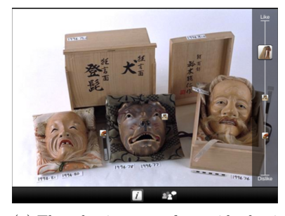
(a) The selection scene for rapid selection of interesting images