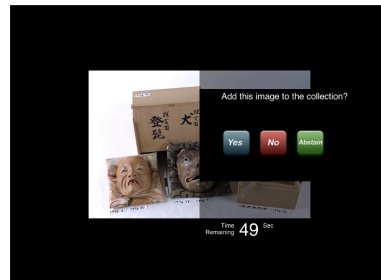
(d) The vote scene for deciding to add images to the group collection

Figure 3: The WeCurate user interface. Bubbles represent tags and are resizable and movable; icons visible on sliders and images represent users.