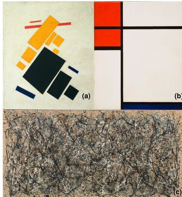
Figure 1. Three of the paintings used in the experiments. (a) Kasimir Malevich (1878–1935) Suprematist Composition: Airplane Flying , 1914–15. (b) Piet Mondrian (1872–1944) Composition , 1933. (c) Jackson Pollock (1912–56) One, Number 31 , 1950.