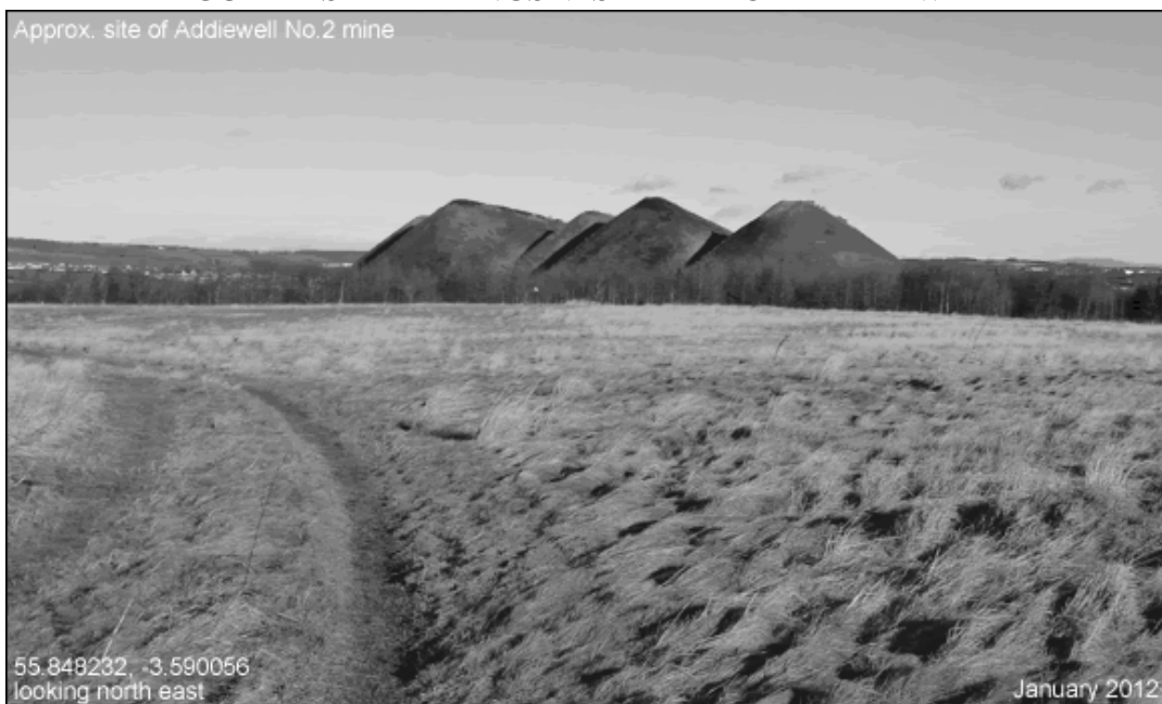
FIGURE 2 SHALE BINGS VISIBLE FROM ADDIEWELL