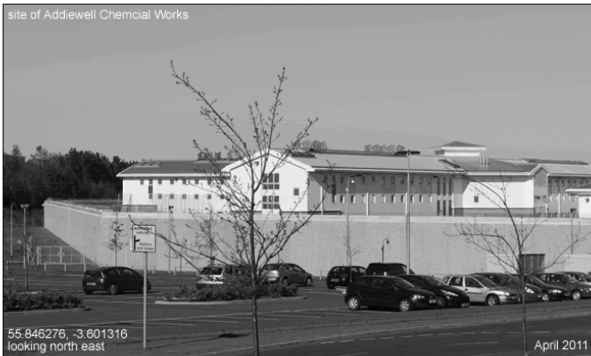
FIGURE 3 HMP ADDIEWELL ON SITE OF OLD CHEMICAL WORKS