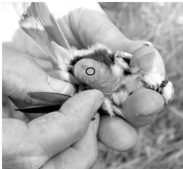
Figure 1. Brood patch of a Blue Tit indicating the position at which temperature was recorded (circled) on a grade 3 brood patch.

Brood patches were assessed according to their stage of development as defined on the following scale of