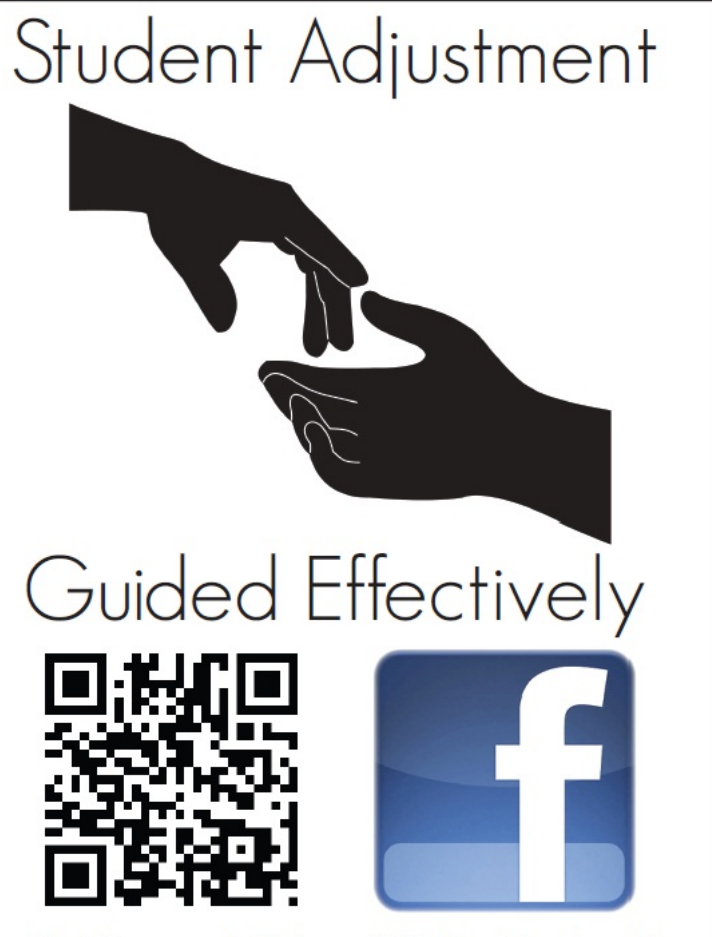
'Like' Emmanuel College SAGE on Facebook!

Upon joining the program you will be paired with a full-time Emmanuel College student who has been enrolled for a full year or more. Guides are here to help you navigate the many academic, co-curricular, and social opportunities available. They can help you experience everything Emmanuel has to offer all while living your first year to the fullest potential.