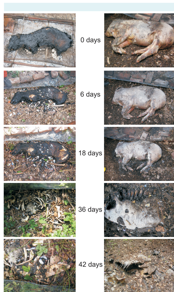
FIGURE 2. Experiment performed during the summer: stages of decomposition of the burnt (left) and the control (right) pigs.