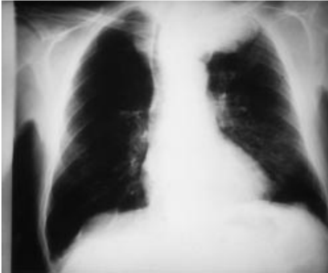
Fig. 3. Chest X-ray, NSCLC (mediastinal).

sense and antisense strand primers and cycling parameters used to detect transcripts were as follows: