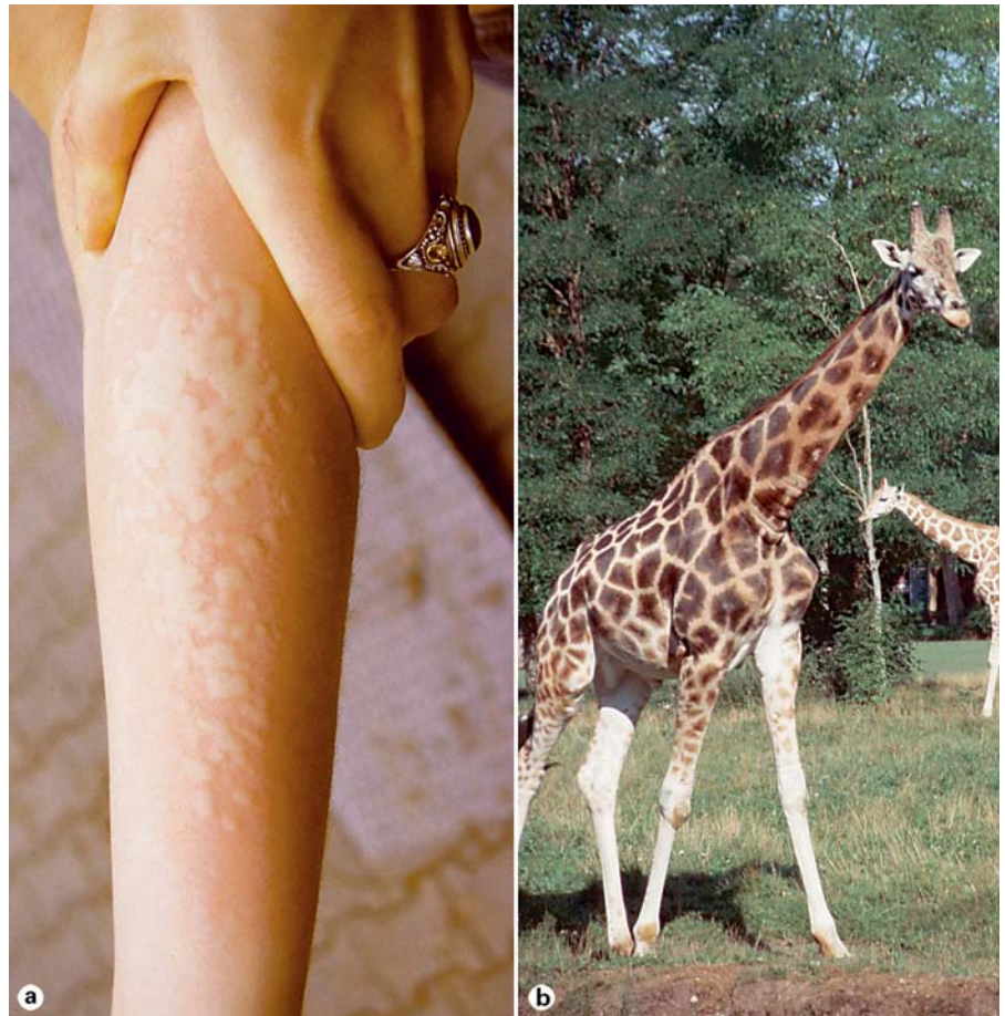
Fig. 1. a Wheals with surrounding reflex erythema on the volar aspect of the patient's right forearm minutes after contact to the giraffe's forehead. b Male Rothschild's giraffe.