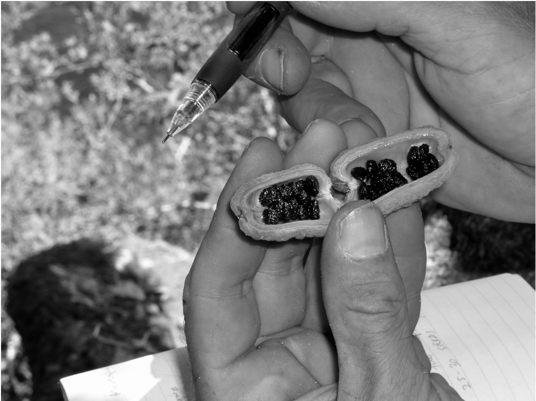
FIGURE 3. Pittosporum balophilum capsule with seeds.

forming a tube at anthesis (Figure 4) are indicative of moth pollination. Swezey (1954) was aware of several orders of insects associated with Pittosporum and made reference to a few moth genera including species of Hyposmocoma , Diplosara , and Parectopa (Lepidoptera). Steven L. Montgomery (2007, pers. comm.) noted additional species of Hyposmocoma and Philodoria (Lepidoptera) that are associated with Pittosporum along with several species of Plagithmysus (Coleoptera), Sarona (Heteroptera), and Drosophila (Diptera). Currently, herbarium vouchers and cultivated individuals indicate that P. balophilum is, with very few exceptions, functionally unisexual, having separate male and female plants. Yet the only two female individuals at Huelo produced viable seeds in the absence of male plants on the islet, and the isolated plant at