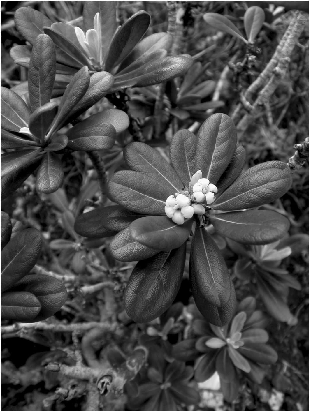
FIGURE 4. Pittosporum halophilum in flower (pistillate individual).