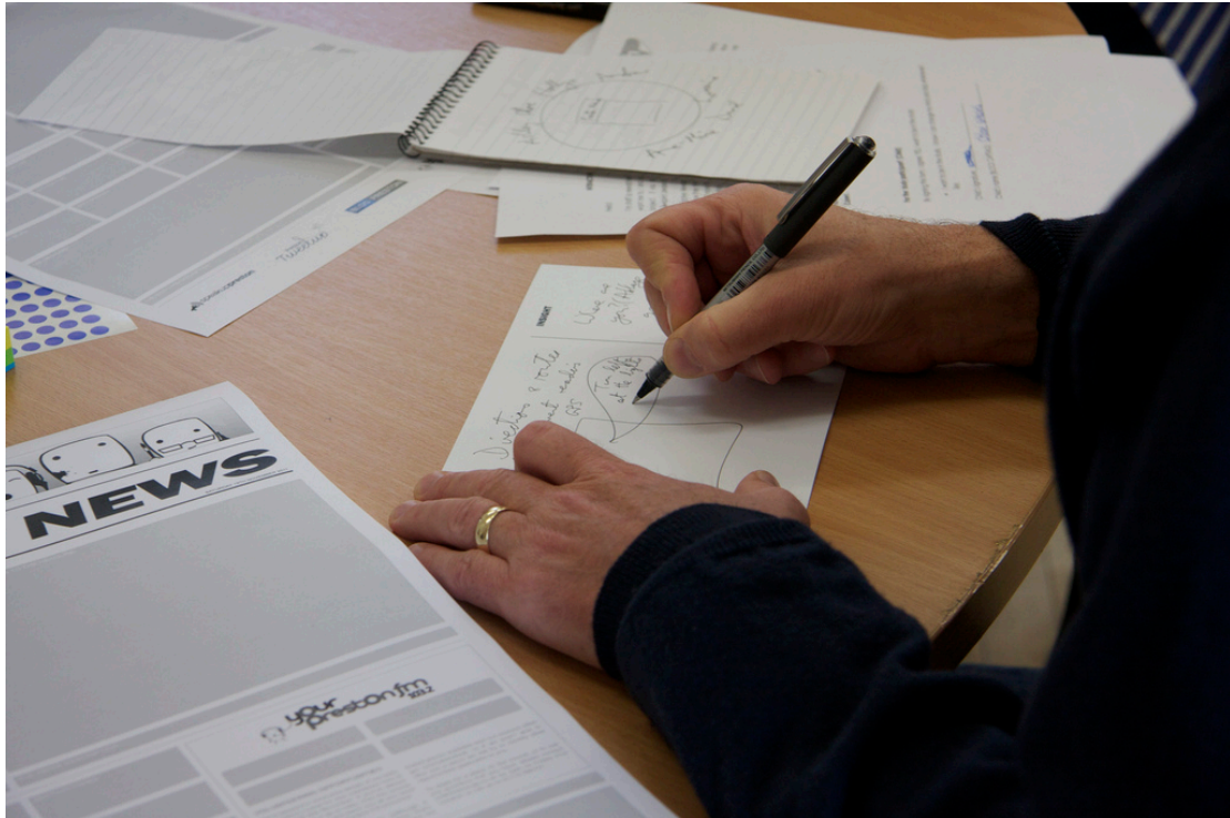
[Figure 2: Interactive Newsprint workshop: participants sketch future technology uses]

Further discussion was prompted by a series of pre-prepared templates inviting participants to design their own community newspaper detailing the technologies they thought most useful, whilst adding their own ideas on further developing and refining the technology and on what content they thought might be most appropriate and useful for their communities. At the end of the workshop, the research team took all the conversations and completed templates away with them promising to review the data and to produce a small workbook featuring common aspects of all the design ideas generated by the community – and to distribute the workbook for a second stage review by participants to further iterate the next series of prototypes.