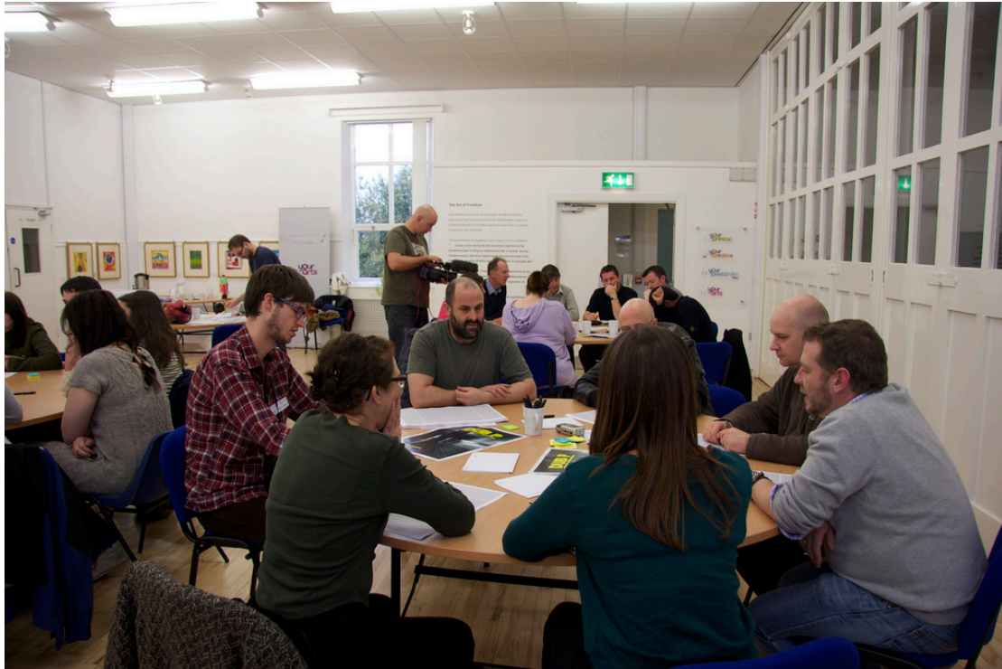
[Figure 1. Interactive Newsprint workshop: November 19 th ]

A series of 3 platform prototypes intended to demonstrate the technology and stimulate discussion on usability were presented briefly. Researchers briefed the group about the overall project objective and their specific objectives and expectations for the workshop itself. Groups naturally formed around each demonstrator prototype and a member of the research team joined each group as a reporter on the discussions that followed. The conversations explored a range of issues – from the specific limitations and affordances of the technology, through usability and into the economic models that might make a new platform for community news viable and sustainable. The conversations were recorded using lightweight video and audio recorders. Researchers in each group also took extensive notes.