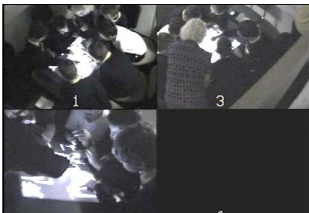
Figure 2: Children Playing 'Surface Pipes'

in water pipes. The 'leaks' appear in random locations at a predefined interval until the game ends, the leaks also have a randomly generated size within a defined range. The players must hold their fingers down on the leaks until the game ends (a game lasts 1 minute and 20 seconds). The score represented the amount of water lost and the aim of the game was to 'save' as much water as possible, thereby achieving a low score. The size of a leak was related to the amount of water escaping, therefore allowing a large leak to continue would increase the score more significantly than a small leak. The random sizes of the leaks were controlled to ensure some level of comparability between different games. The random locations of the 'leaks' allowed users to practise playing the game without any possibility of learning where the points would appear. The background to the gameplay is a collection of pipes rendered in 3D and the 'leaks' appeared as animated circles of rippling water as shown in Figure 1, water sound effects were also played during the game. The screen also showed the amount of time remaining before the game ended and a '% Flow' to help indicate how much water was being lost through the leaks, 100% being no loss and 0% all water lost through leaks.