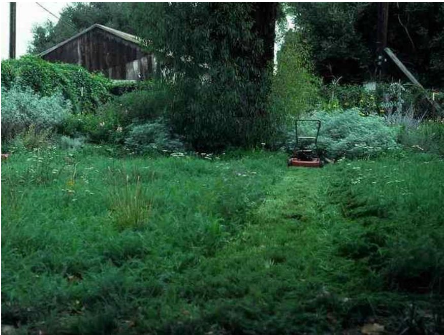
Figure 4. Selfheal lawn in spring.