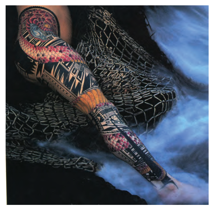
Figure 2: The Beginning of All Things. Don Ed Hardy, 1982.

features a photograph of a man's leg, covered in heavy blackwork in a 'tribal' style, intersected with a large, brightly coloured purple snake. This tattoo, is certainly not 'authentically' tribal in any sense, but something innovative and exciting, drawing upon the aesthetics of heavy blackwork tattooing in tribal contexts in order to create something resolutely new.