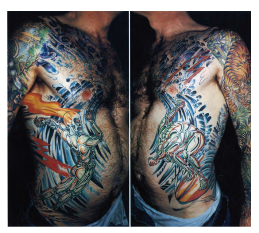
Figure 4: DNA: Tattoo to commemorate successful operation curing total paralysis from auto-accident, Don Ed Hardy, 1989.