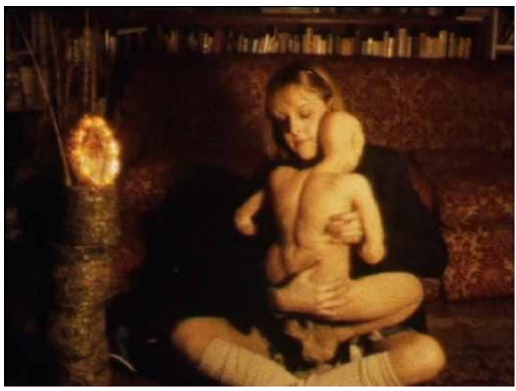
Figure 1: Vivienne Dick, Film Still of Greer with Doll in Liberty's booty , 1980.

notion of the dialectic. 'While analytical montage only calls for him to follow his guide, to let his attention follow along smoothly with that of the director who will choose what he should see, here [in depth of focus] he is called upon to exercise at least a minimum of personal choice' (Bazin, 1967, p.36). His claim for the long look is that 'Neorealism by definition rejects analysis, whether political, moral, psychological, logical, or social, of the characters and their actions. It looks on reality as a whole, not incomprehensible, certainly, but inseparably one' (p.97).