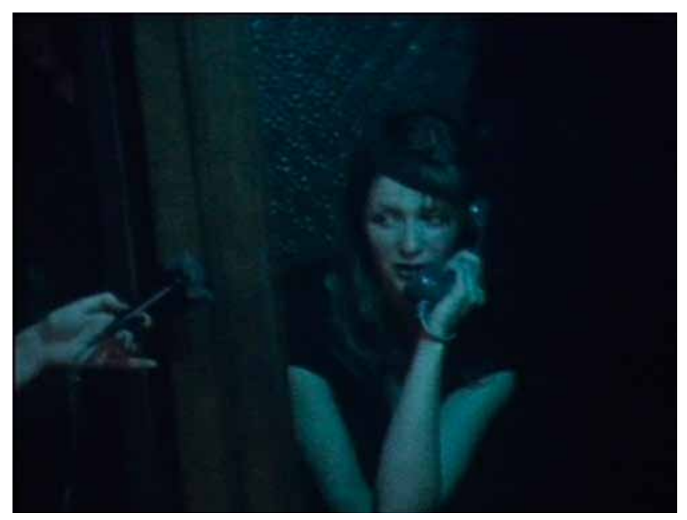
Figure 4: Vivenne Dick, Party Detail (Margaret), Liberty's booty, 1980. Reproduced by kind permission of the artist.

in English, thus assuming an Anglophone audience). The fast cutting, the lack of denouement and the dearth of conventionally coherent film language keep the viewer in the present at all times. In other words the filming reinforces the experiential while the fragmented simultaneity offers a different subjectivity that has to let go of a safe orientation while, at the same time, paradoxically creating that critical distance that makes sure one stays aware of being an active spectator. Key to this sequence is both the positing of home as a disparate simultaneity of features, and the idea of home itself as a place of ambivalence. Both places are sites from where freedom is fought. In Ireland this is clear from the imagery of the Pope, superstition and inequality. A belief in the US as the 'land of the free' is disturbed, inequality is shown to be ubiquitous, through the poverty seen in the areas of New York filmed here and as exemplified through the portrayal of prostitution that exists here, as everywhere.23 By juxtaposing these two scenarios of the social inequalities in both countries, the experience of simultaneity is coupled with a destabilisation of home as a cipher of safety. Neither the US nor Ireland is portrayed as a safe place but as one of corruption and struggle. These are places of negotiation rather than home: where one makes one's life while aware of other places and the world in