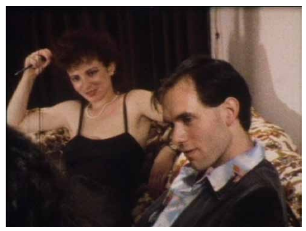
Figure 3: Vivienne Dick, Film Still of Nan and Bobby, Liberty's booty, 1980.

The film depicts a group of young women, who are making a living from prostitution. A multiplicity of methodologies are used in the construction of the film. The dominant strategy is fly-on-the-wall documentary to describe their day-to-day lives in New York's Lower East Side. The apartments filmed are all furnished with second-hand vintage furniture and the actors are wearing a self-consciously second-hand style of clothing.22 The narrative, such as it is, is constantly disrupted by a shifting visual pace as well as the deliberate breaking up of the desultory or experimental documentary genre into poetic performance. At the centre of the film is a series of passages that crystallises the subjectivity that is being constituted through the film. This sequence makes the link between the timelessness of casual labour (because prostitution has been part of every known society) and the pivotal moment of the expansion of the McDonald's brand