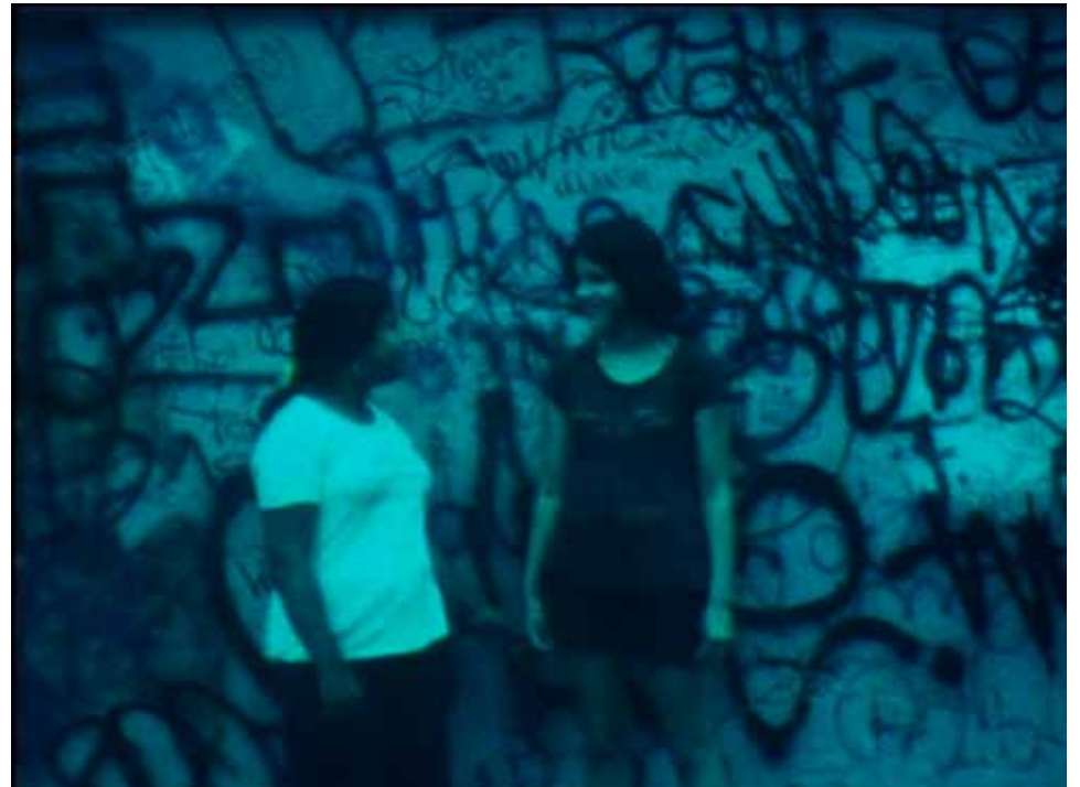
Figure 2: Vivienne Dick, Film Still of New York Playground, Liberty's booty , 1980. Reproduced by kind permission of the artist.

Another way of reflecting on the relationship between montage, maximalism and the cosmopolitan is through thinking about Krauss's claims in her work on surrealist photography. Collage and photomontage are not interchangeable terms, and Krauss makes the distinction important in her analysis, where she argues that collage was 'a too willing surrender on photography's hold on the real' (Krauss et al, 1985, p.28). In order to reflect on my concern with the multivalent image I will put aside some of these important differences.<sup>19</sup> Krauss argues that photography normally aims to offer a seamless version of reality which photomontage then disrupts as a critique of the indexical. Through the disruptions of the blank spaces or gaps between one 'shard of reality and another', meanings are created through a language effect of self-contained structures which allows one to 'infiltrate reality with interpretations' and particularly through photo montage due to its seamless surface but disjointed imagery (Krauss et al, 1985, p.24). Drawing Krauss and Mercer together, one may infer that it is the disjunction between images that re-interprets the world in effect. Krauss cites John Heartfeld who states that photo-montage 'expresses not simply the fact