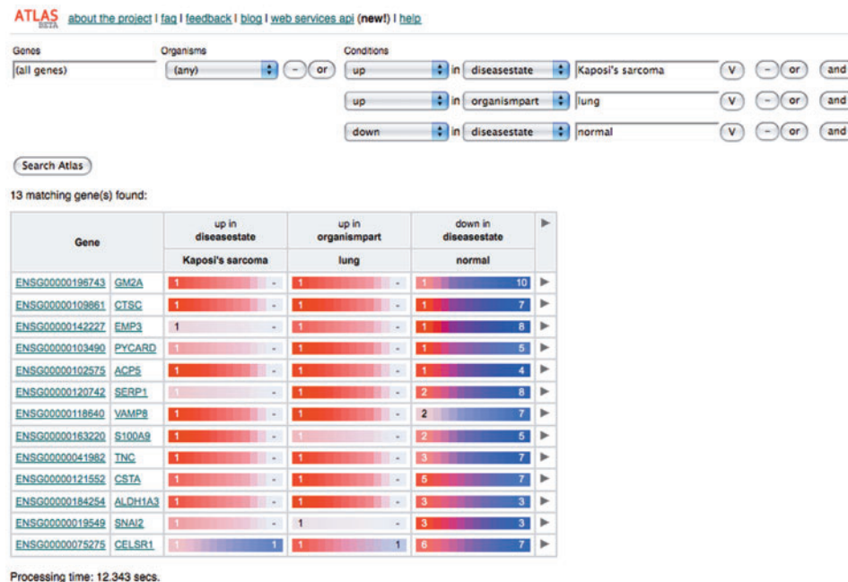
Figure 3. ArrayExpress Atlas advanced query interface showing all genes up-regulated in Kaposi's sarcoma diseased lung tissue and down-regulated in normal samples.

cell (Figure 3). More complex queries combining several conditions are available via the advanced Atlas interface.