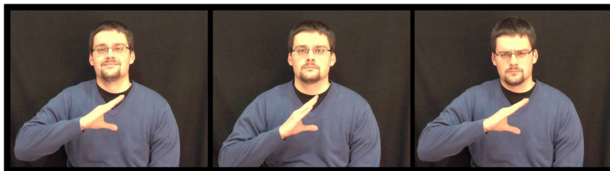
FIGURE 1 | Stills taken from stimulus video of one actor portraying from left to right: happy, neutral, and angry facial expressions.