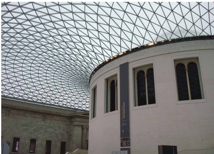
Figure 4 Great Court (Digital photo: Caspar Pearson, 2012)