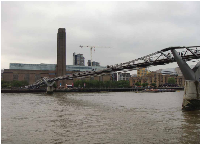
Figure 3 Millennium Bridge towards Tate Modern (Digital photo: Caspar Pearson, 2012)

The figures, and their captions should have appeared as follows: