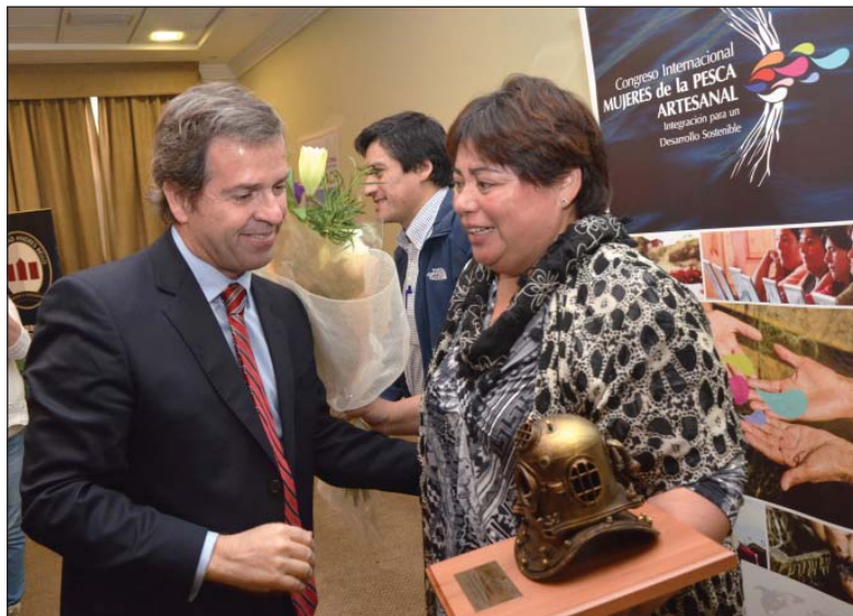
There were 150 women members from CONAPACH at the International Congress of Women in Artisanal Fisheries held in Valparaíso, Chile from 5-7 June 2013