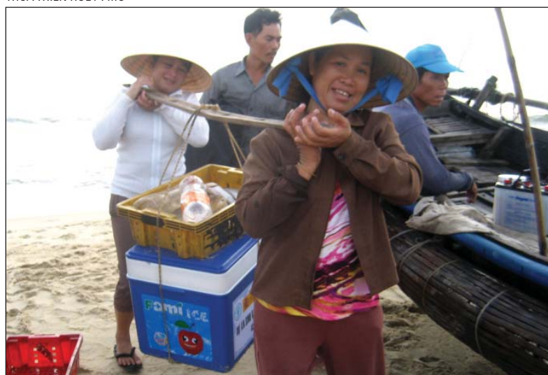
Women in Phong Hai commune, Thua Thien Hue province, with the ice boxes provided by RFLP, Vietnam