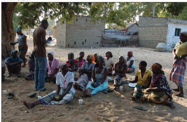
Women in the Conguiana community, Inhambane province, Mozambique engage in post-harvest fisheries activities