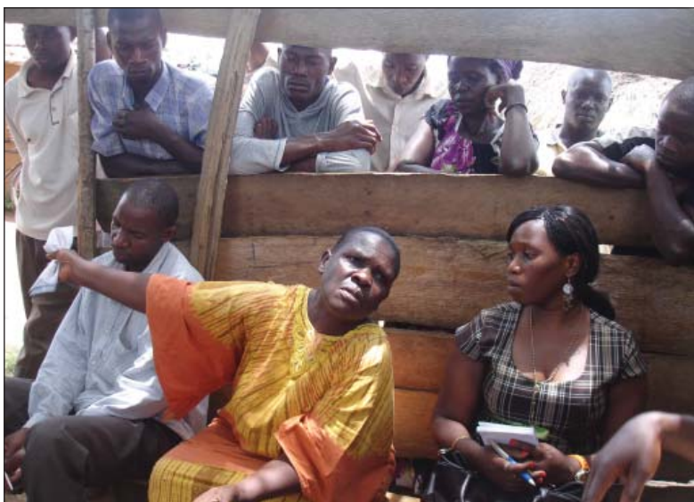
Community dialogues enable KWDT to engage communities in decisionmaking on the access and use of their fisheries resources