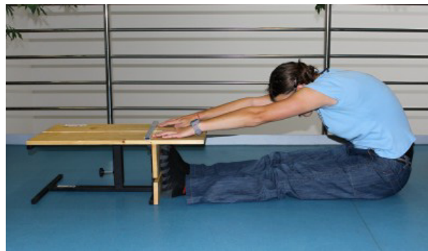
Figure 1. The sit-and-reach test with an overlap over the zero point.

Authors K. F. Wells and E.K. Dillon were among the first researchers, who developed tests of flexibility. They described their "sit-and-reach test" in their publication The sit and reach. A test of back and leg flexibility (1952). This test can be used for the measurement of flexibility in the area of the lumbar spine and the back part of the thigh. Up to now, there has been a number of variants of this test of flexibility. The main differences lie in the position of the feet to the measuring device (with either both or only one leg leaning towards the desk) and the location of the zero point on the top of the measuring desk. The most natural way of measuring is with the zero point at the level of the feet. In case the tested person can't reach it, its performance is recorded with a minus sign. However, the use of negative values is inappropriate for the statistical comparison of results. At present, we therefore often encounter a variant of the sit-and-reach test, where the zero point exceeds the feet. The most common versions of the test use either a 15 or 25 cm overlap (Figure 1).