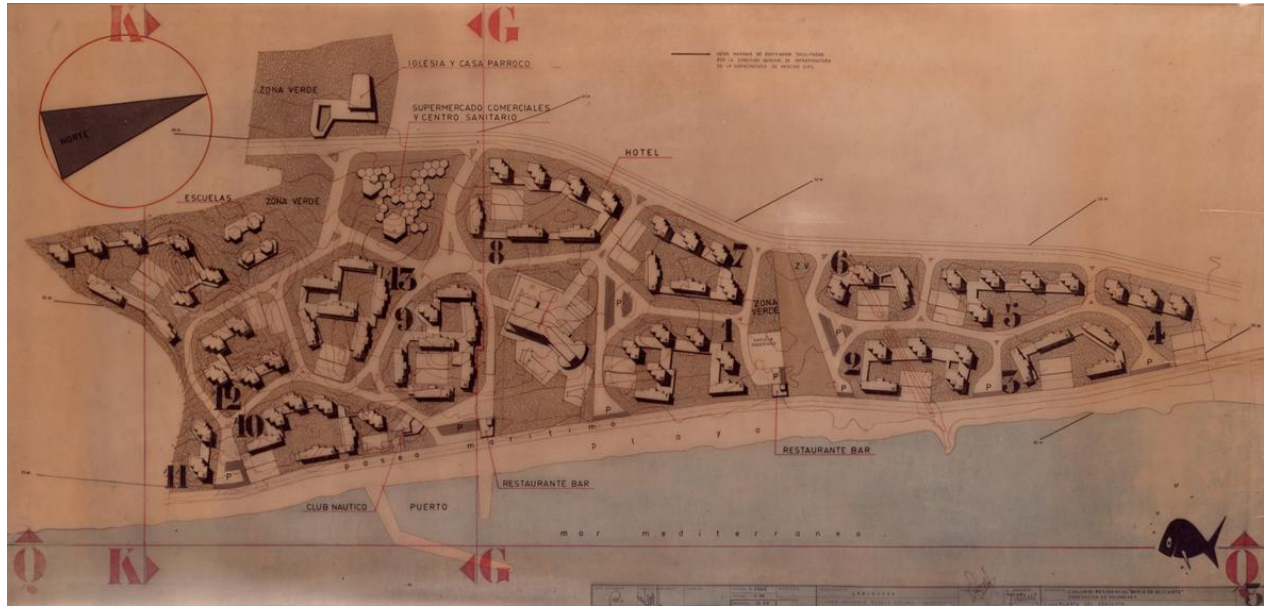
Fig. 5: Plan Parcial Bahía Blanca o Urbanova de Alicante de J. A. García Solera en 1969

floors) elevate in a porticated plant for the sea to be visible from different points in the interior (Oliva 2005: 132-146). Significantly the houses present programs that adjust to the requisites of the public protected homes, which points to a double vocation of this neighbourhood: destined to vacationers and to residents who looking for escape from the traditional cities.