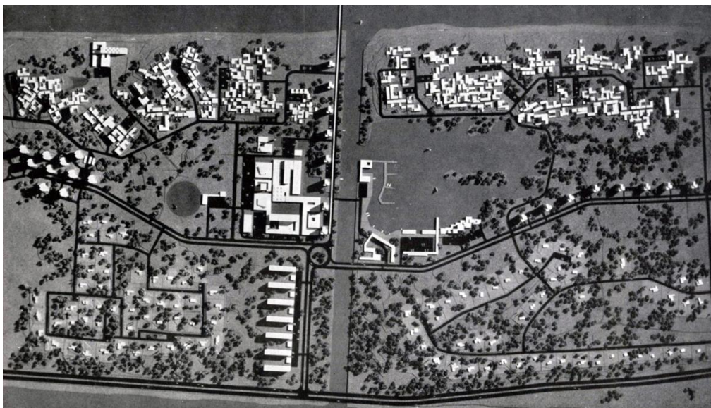
Fig. 3: Central stretch of the model proposed for El Saler by J. Cano Lasso (1962-64)

Simultaneously, Julio Cano Lasso’s team projects the distributions of the Albufera and the beaches of El Saler (1962-64), a similar geography to La Manga: a dunes bar and pine trees between two seas with a front of 10km south of Valencia. Although the area to urbanize is bigger, the density remains under 100 inhabitants/hectare (Aa. Vv. 1964a: 21). Both urban development arrangements share the same urban criteria. Distributions here are also linear and they also support the future costal motorway, if it is here only tangent in the project. The proposal of El Saler differentiates three sectors: one north, closer to the capital, where are foreseen only buildings for weekend demands, and the other two sectors at the south swinging between two shopping centers where residential zones extend. The central sector is the biggest; its structure based on two key elements: the pedestrian promenade of the beach and a perpendicular axis of access to an artificial internal lake. This serves as a marina, and beside it there is a big social and commercial center and hotels (Aa. Vv. 1964).